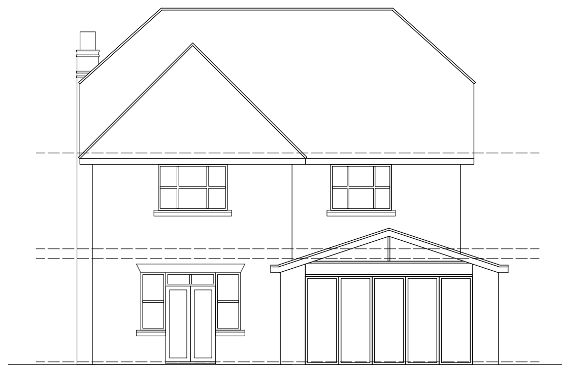
3 South (rear)