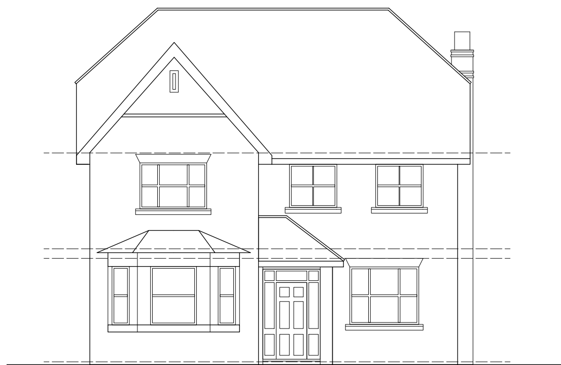
2 North (front)