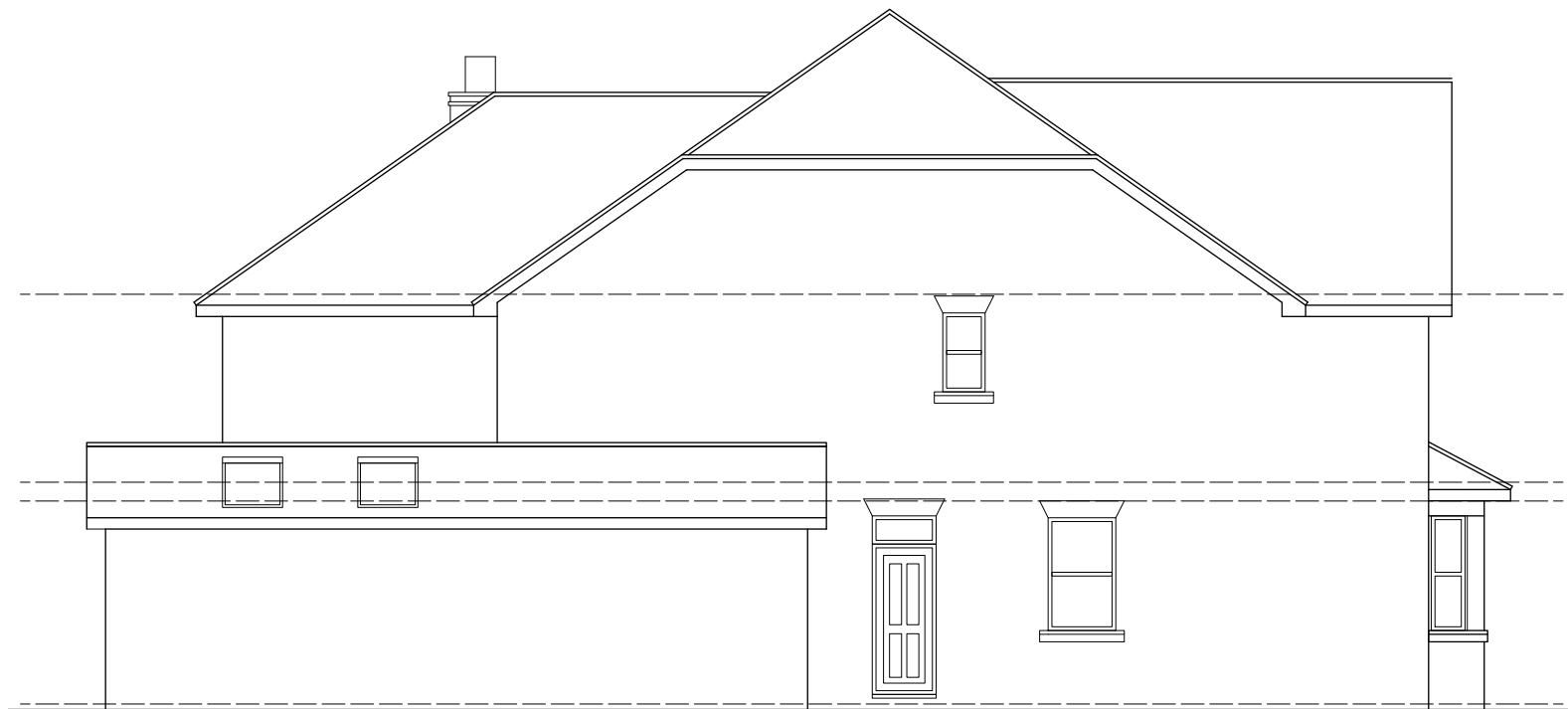
5 East (right)