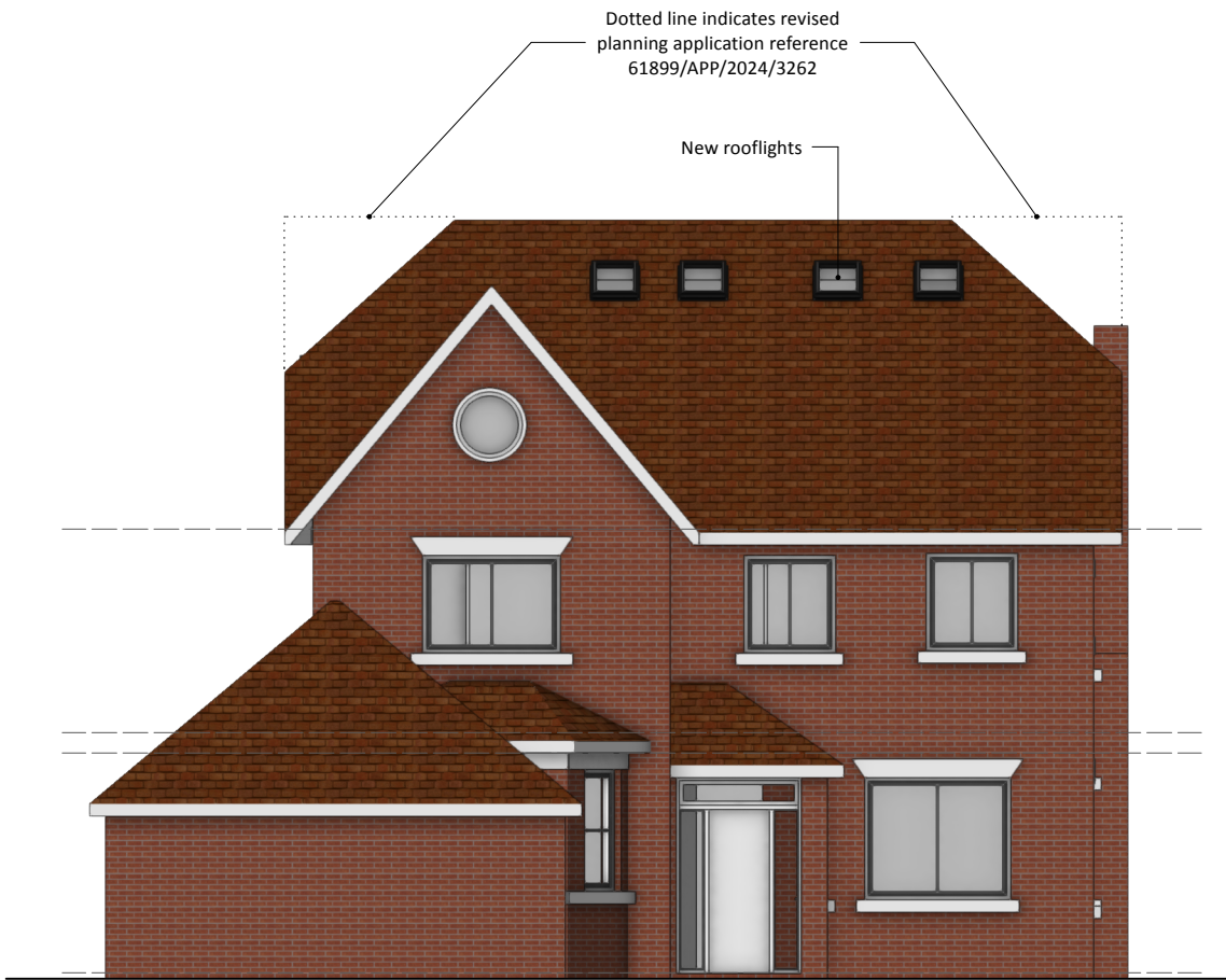
1 North (front)