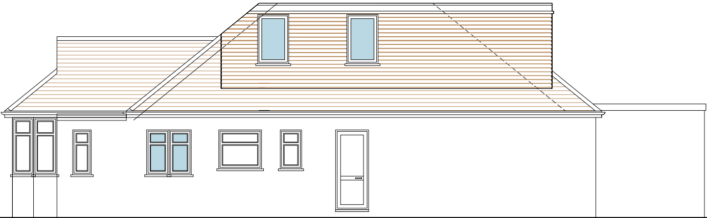
PROPOSED SIDE (1) ELEVATION