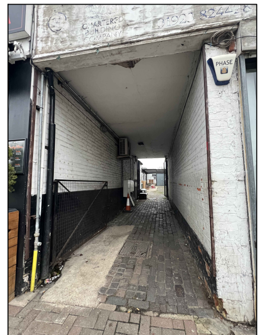
PHOTO SHOWING UNDERCROFT ACCESS IN BETWEEN 14 & 16