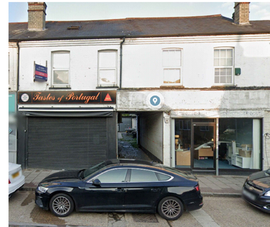
PHOTO SHOWING UNDERCROFT ACCESS FROM HIGH STREET