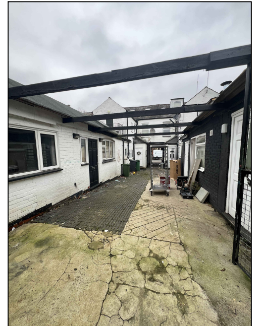
PHOTO SHOWING SHARED ACCESS IN BETWEEN 14 & 16