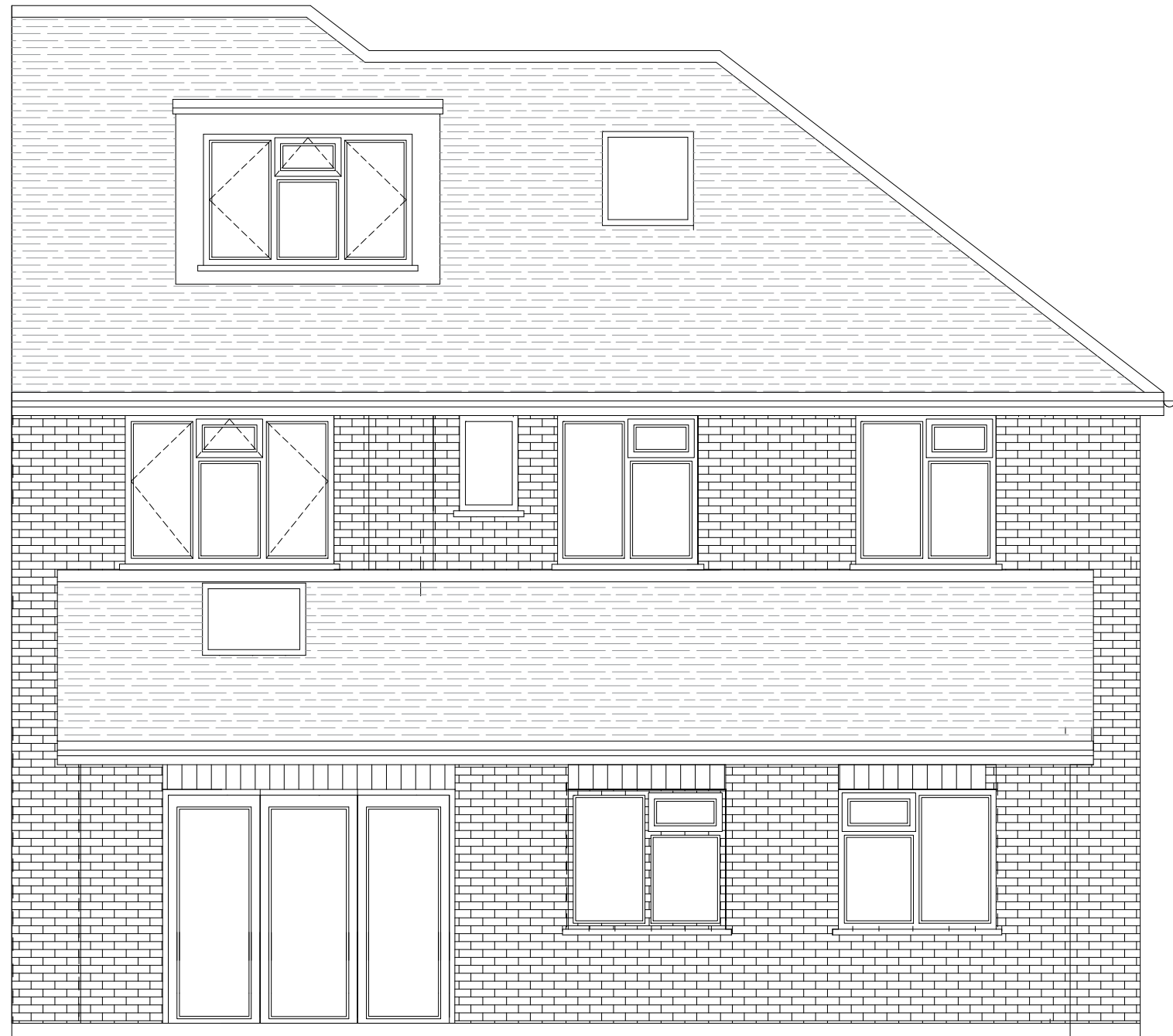
EXISTING ELEVATION C REAR