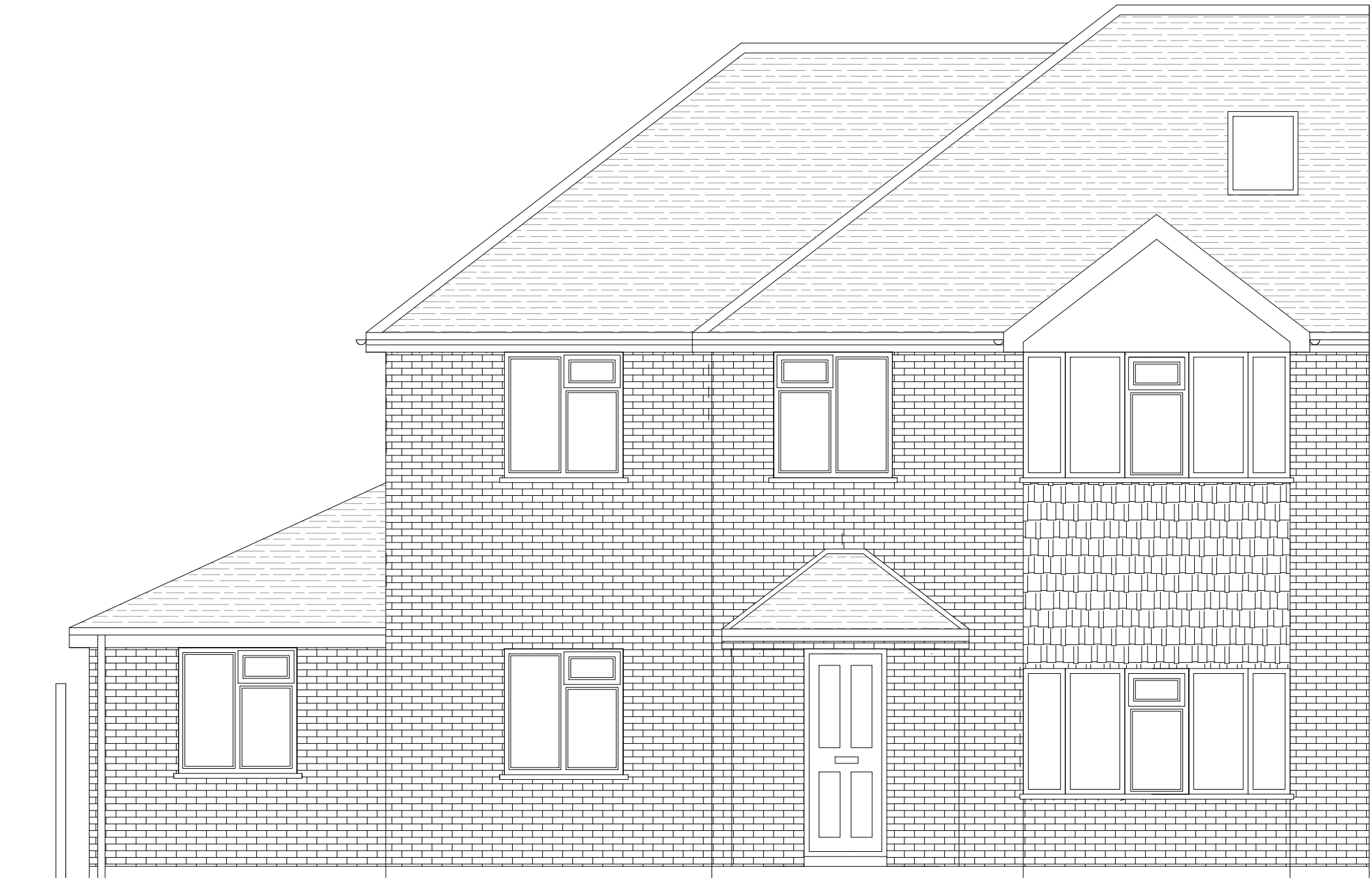
PROPOSED ELEVATION A FRONT