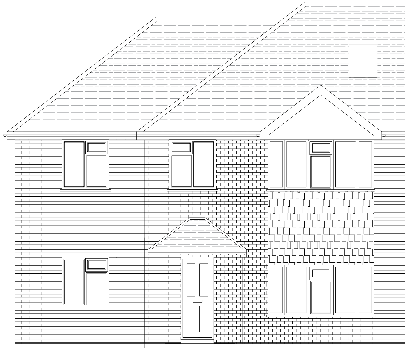
EXISTING ELEVATION A FRONT

Written dimensions to be taken in preference to scaled dimensions.