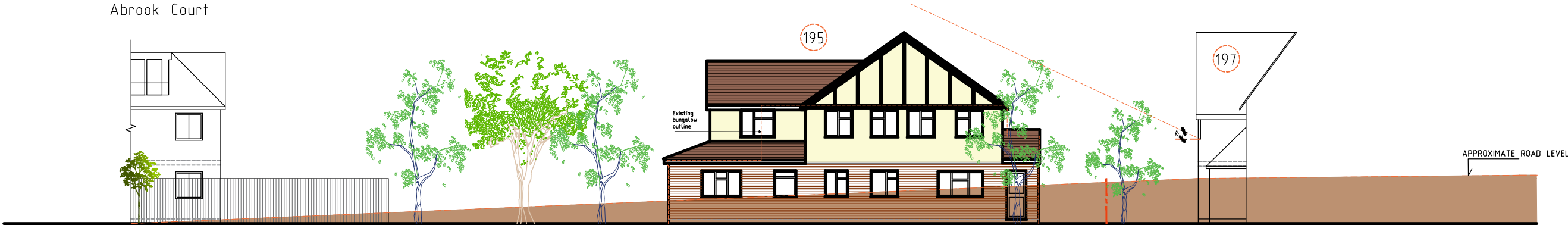
PROPOSED STREET SCENE 1:200@A3