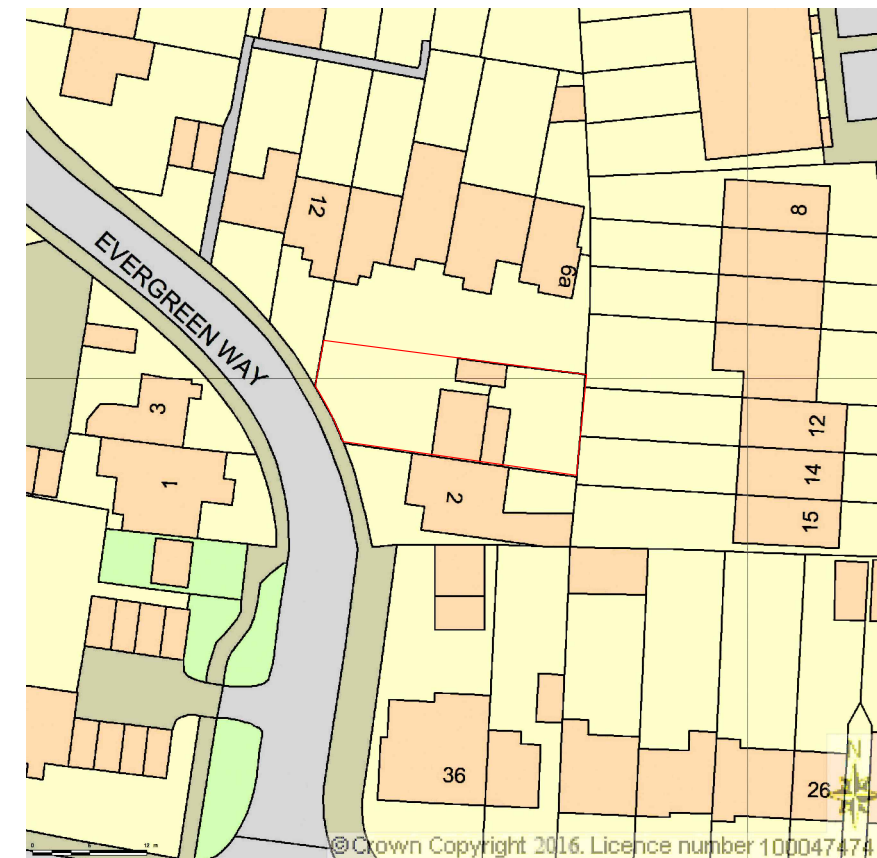
Location Plan @ 1:1250

Proposed Development: Single Storey Rear Extension