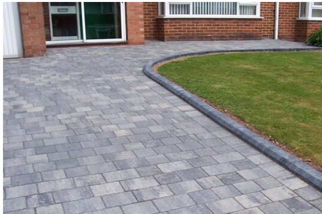
Front drive: Grey tegula block pavements (permeable construction)