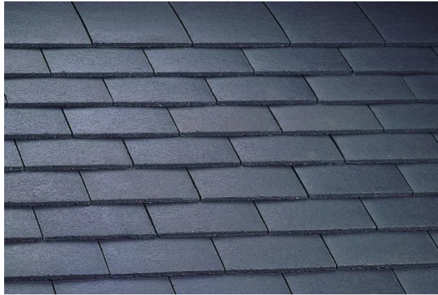
Roof covering: Marley plain concrete roof tiles, smooth grey