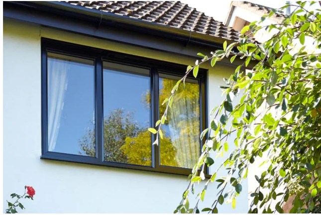
Windows: uPVC windows with anthracite grey external finish