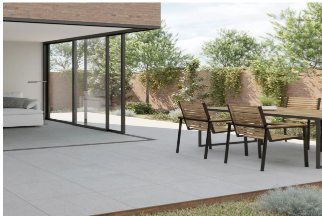
Rear garden patio: Grey porcelain paving tiles