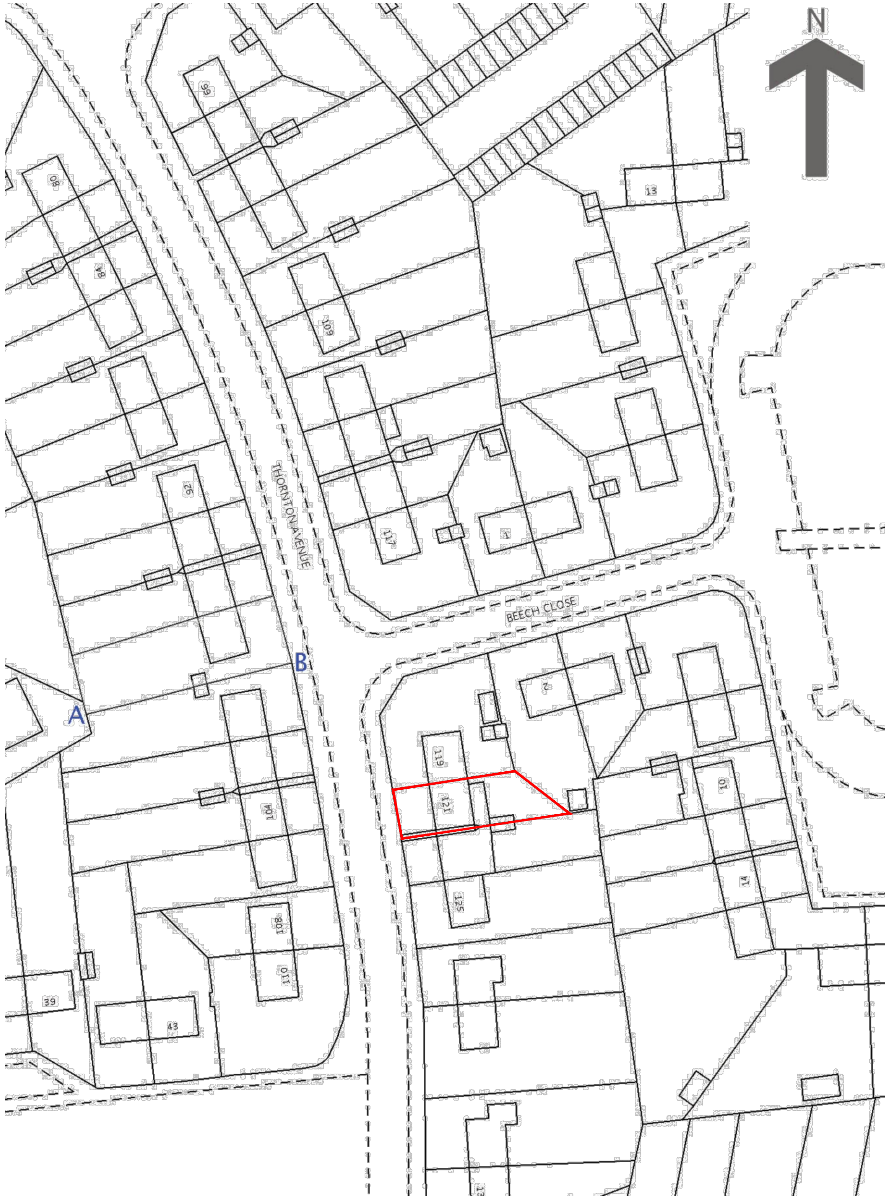
03 - OS MAP SCALE 1:1250