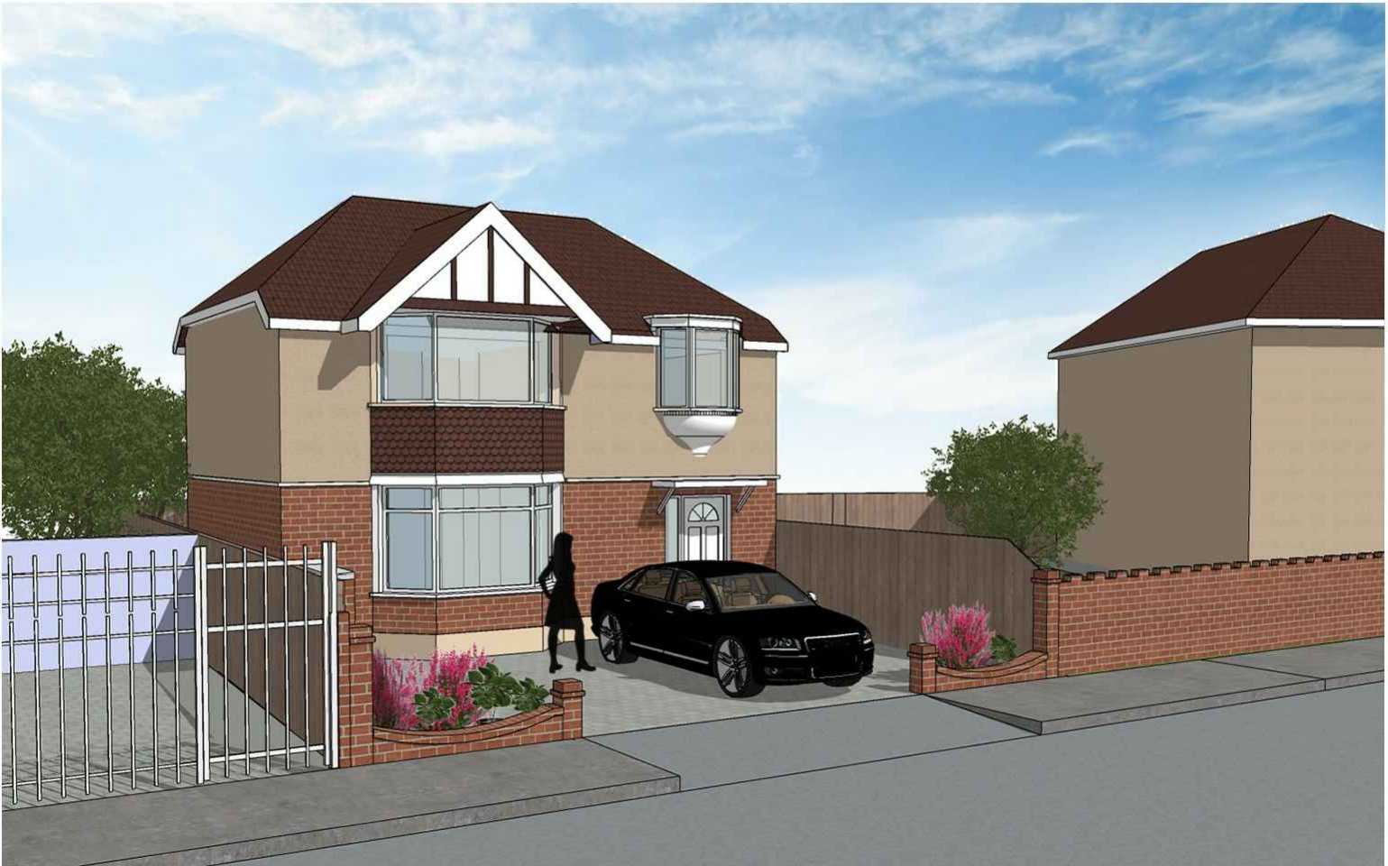
3D VIEW (NORTH-WEST)