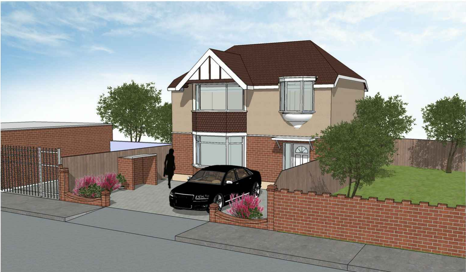
3D VIEW (SOUTH-WEST)

Contractor to check site thoroughly & report any discrepancies.