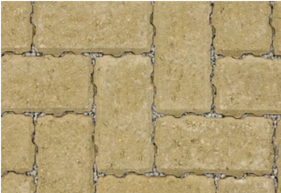
DISABLED PARKING – MARSHALL'S DRIVELINE PRIORA (BUFF EDGING)