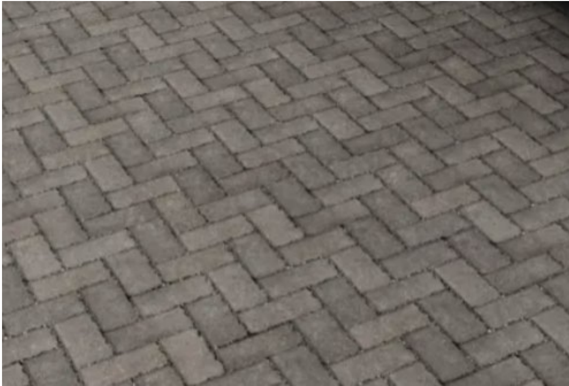
DISABLED PARKING – MARSHALL'S DRIVELINE PRIORA (CHARCOAL)