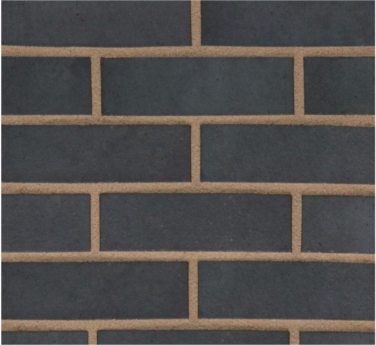
DWARF BRICK WALLS - WIENERBERGER K209 CLASS B BLUE 65MM PERFORATED WIRECUT ENGINEERING BRICK