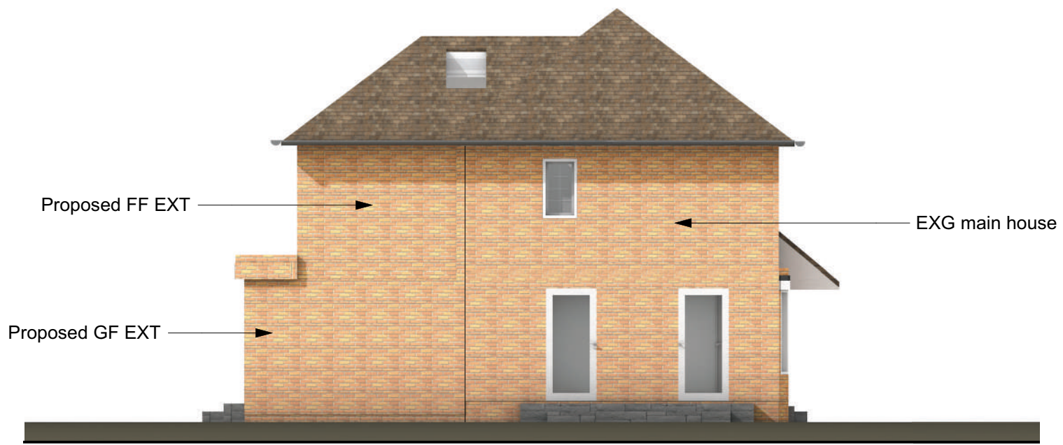
1 SIDE ELEVATION Scale: 1:100