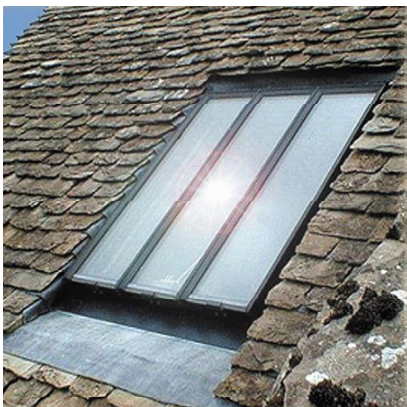
ROOF LIGHTS Conservation style rooflight "the rooflight company" or similar. To be flush with roofline. Both rooflights to be conservation style and both rooflights to be obscurely glazed.