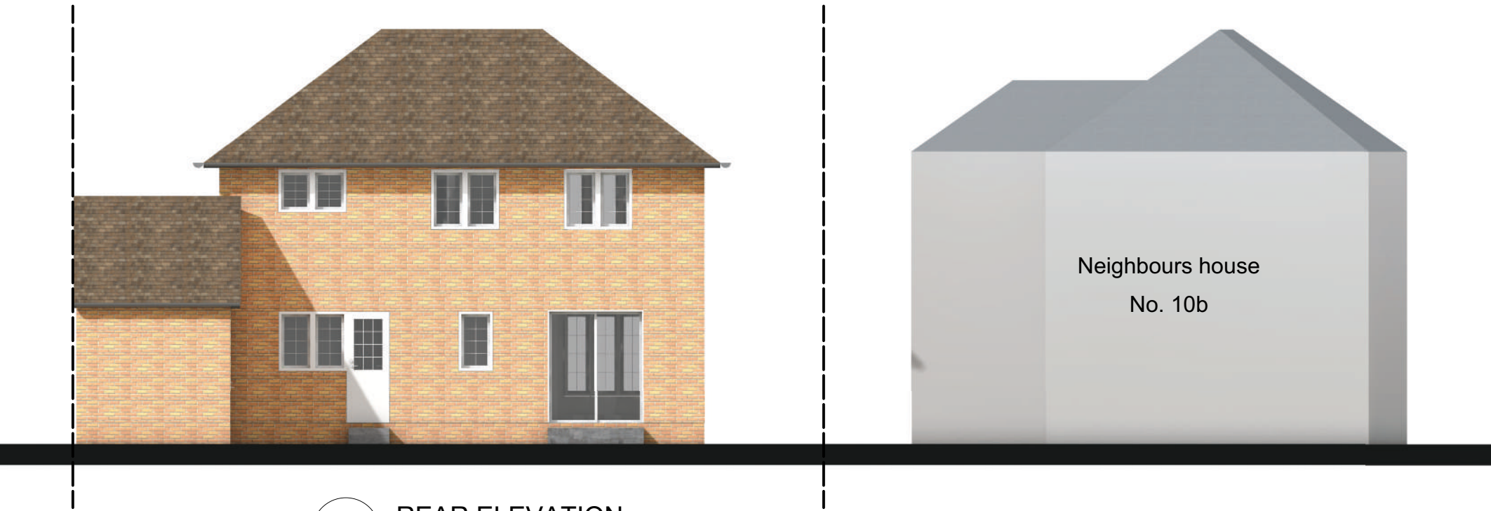
2 REAR ELEVATION Scale: 1:100