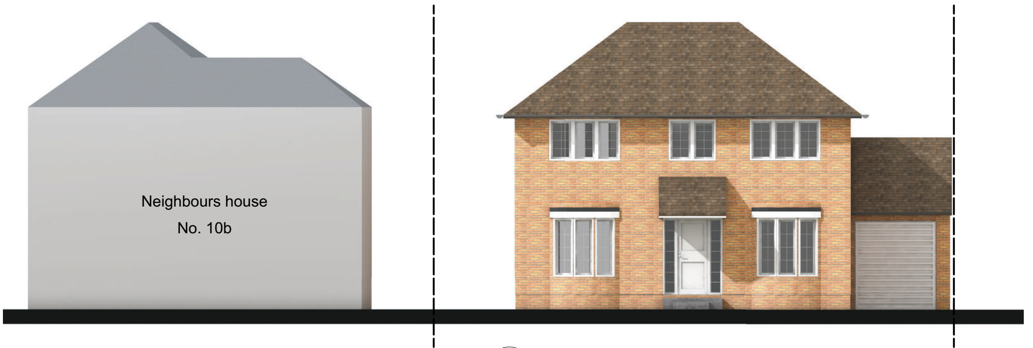
1 FRONT ELEVATION Scale: 1:100