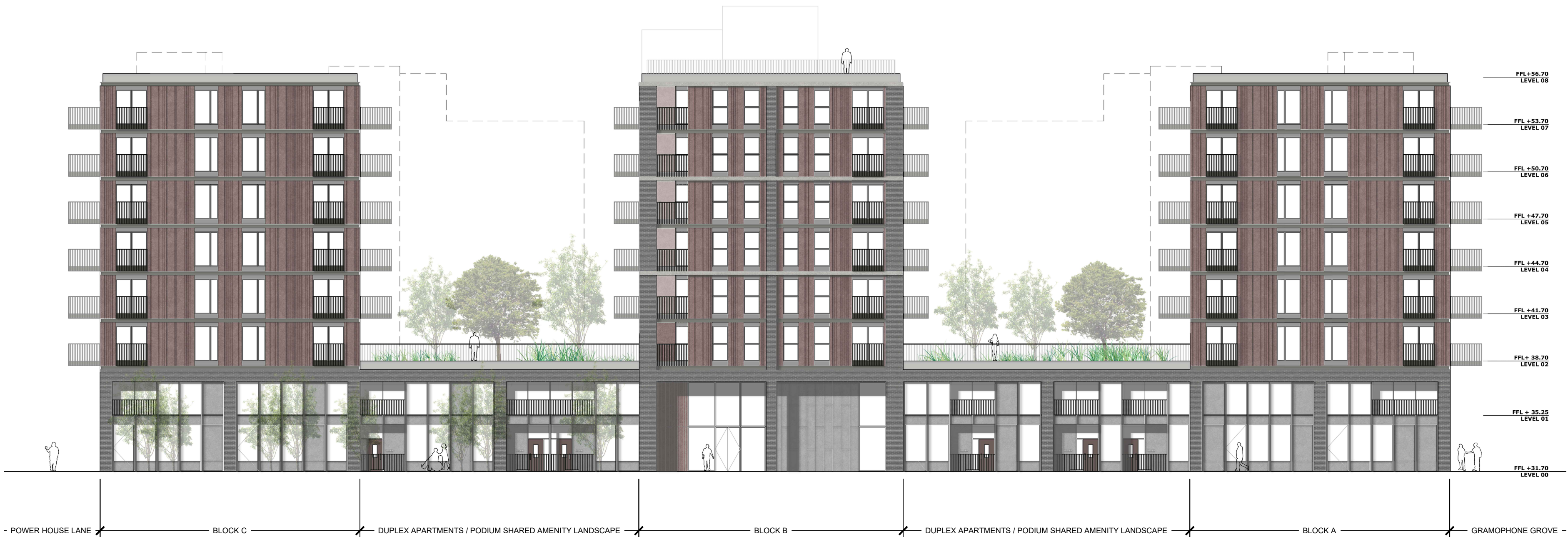
Proposed North Elevation