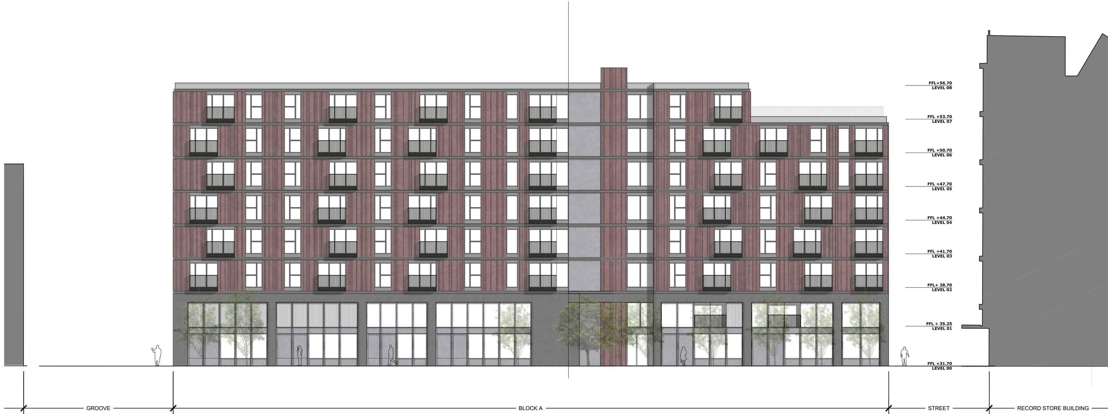
Proposed Block A West Elevation