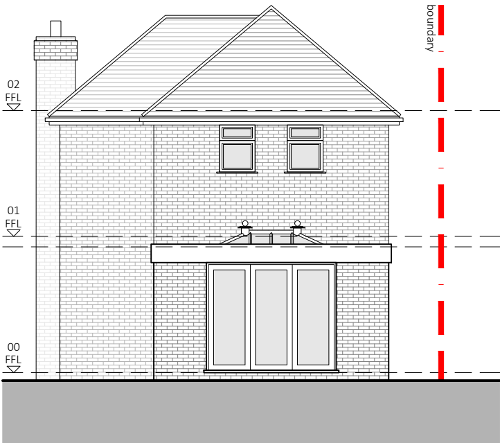
PROPOSED REAR ELEVATION (SOUTH) 1:100