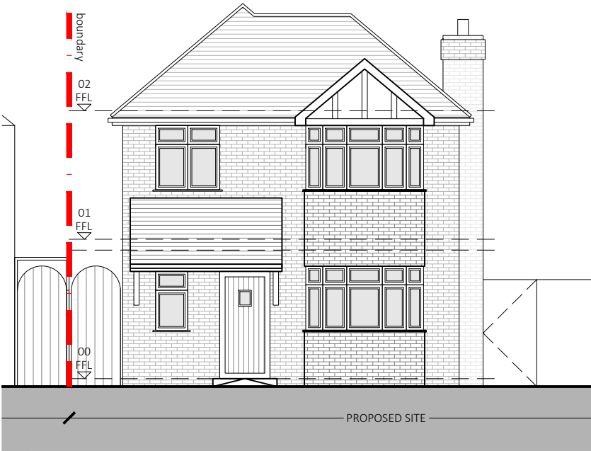
PROPOSED FRONT ELEVATION (NORTH) 1:100

© This drawing is the property of Oxbridge Design and Detailing Services Ltd. Copyright is reserved by them and is issued on the condition that it is not copied or disclosed by or to any unauthorised persons without the prior consent in writing.. All Dimensions to be checked on site any discrepancies must be reported to Oxbridge Design Detailing Services Ltd. prior to undertaking of any relevant works. Written dimensions to be follow in preference to scaled dimensions and all figured dimensions are millimetres unless otherwise stated.