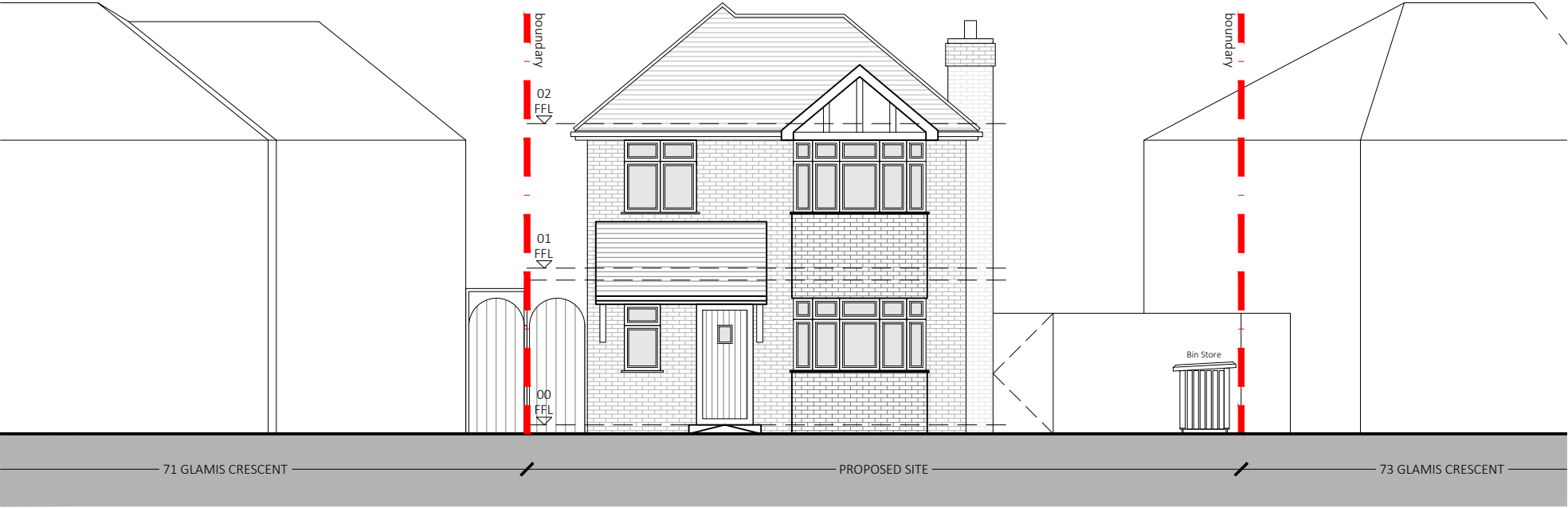
PROPOSED STREET SCENE 1:100