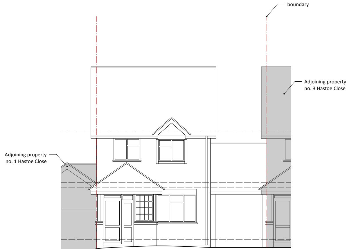
3 South-East (front)