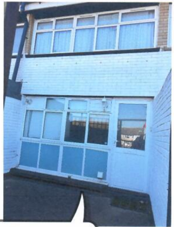
Front Elevation Entrance View