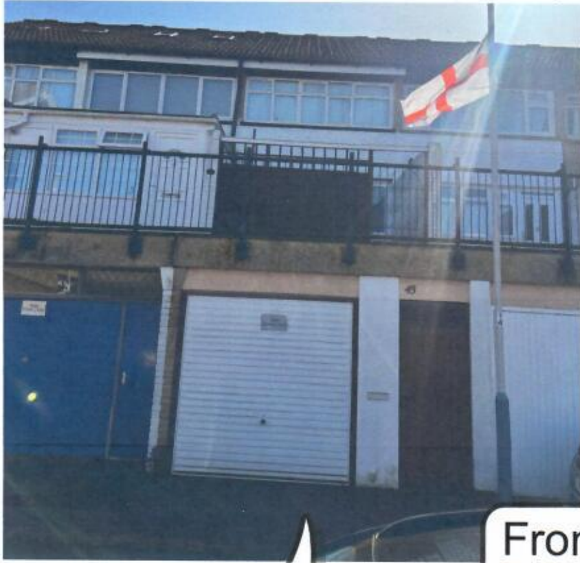
Front Elevation Street View