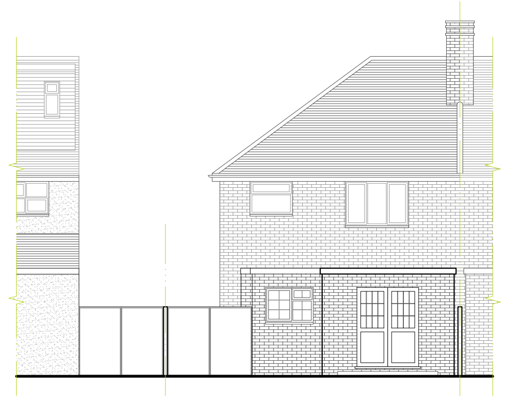
EXISTING REAR ELEVATION (NO ALTERATION)