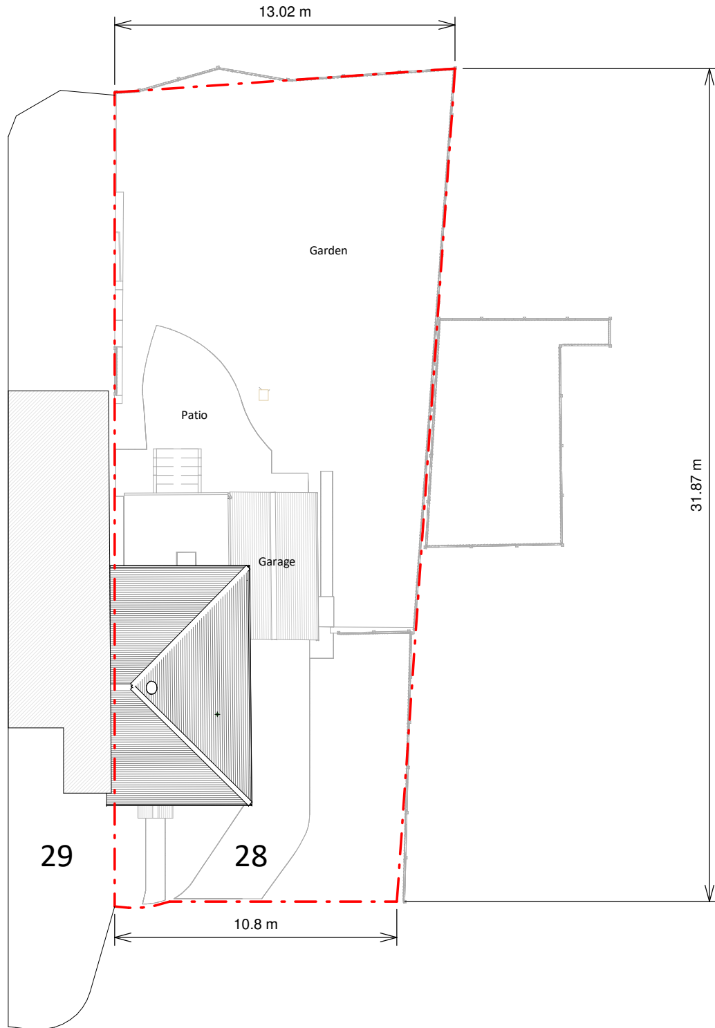
Exsiting Block Plan