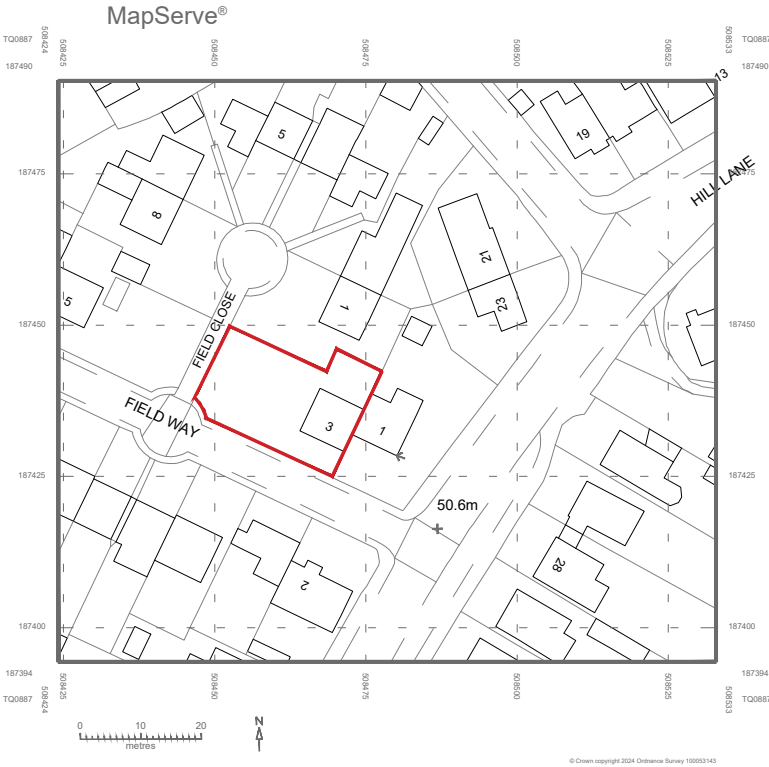
SCALE 1:1250 @ A3

APPLICATION FOR OUTBUILDING FOR ANCILLARY USE OF GROUND FLOOR FLAT