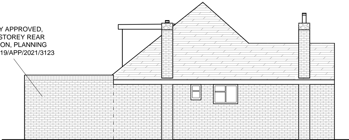
PROPOSED ELEVATION SIDE B

ALREADY APPROVED, SINGLE STOREY REAR EXTENSION, PLANNING REF: 59019/APP/2021/3123