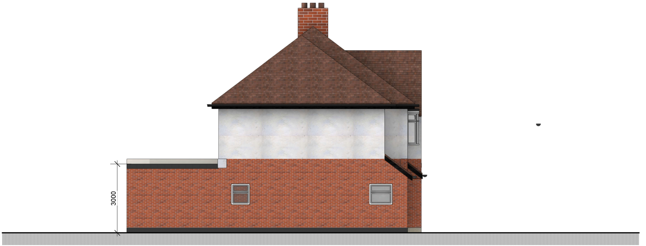
1 01 PROP ELEV SIDE Scale: 1:100