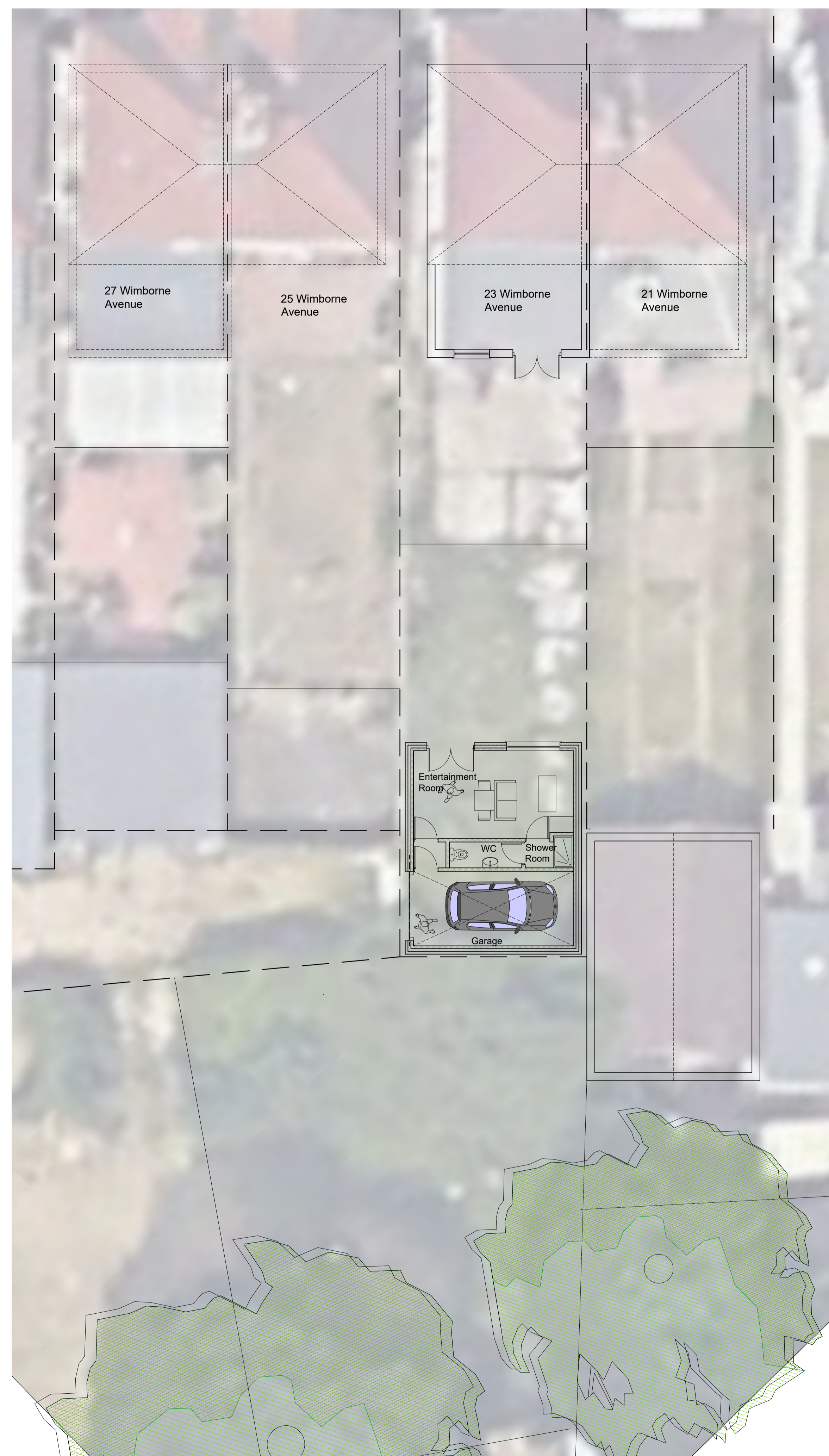
Proposed Ground Floor Plan Scale 1:100