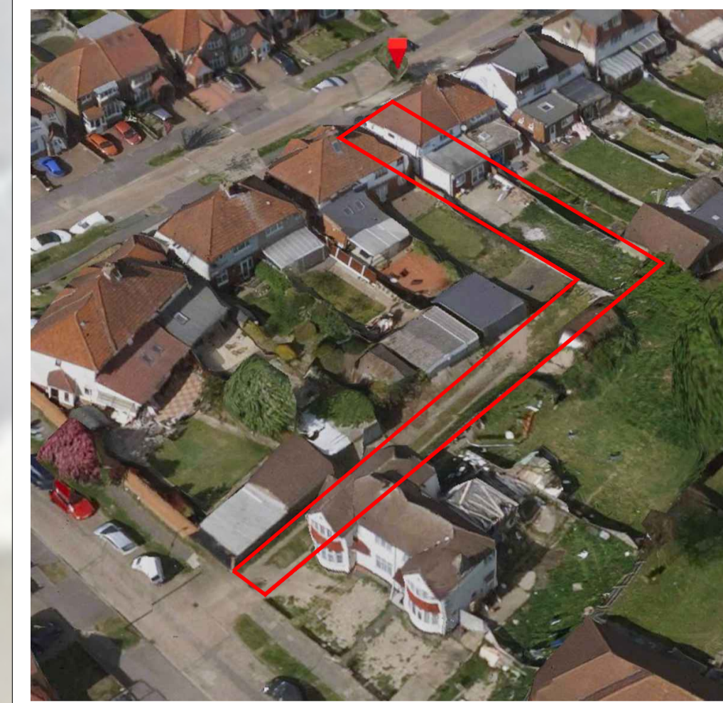
Existing Satellite Image