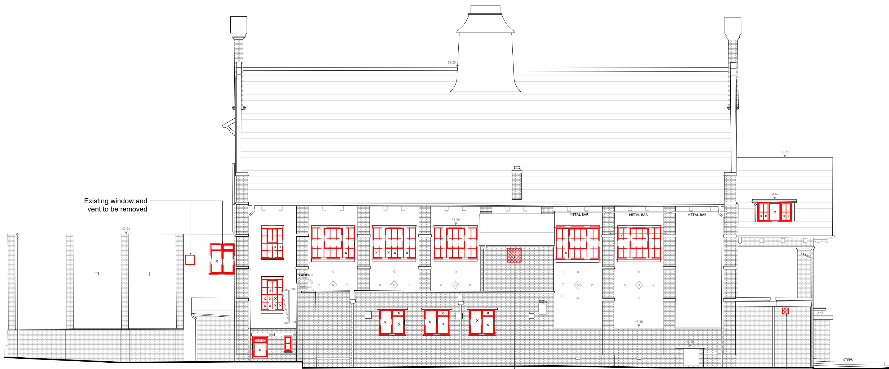
2 West Elevation - Demolition 1060 1:100