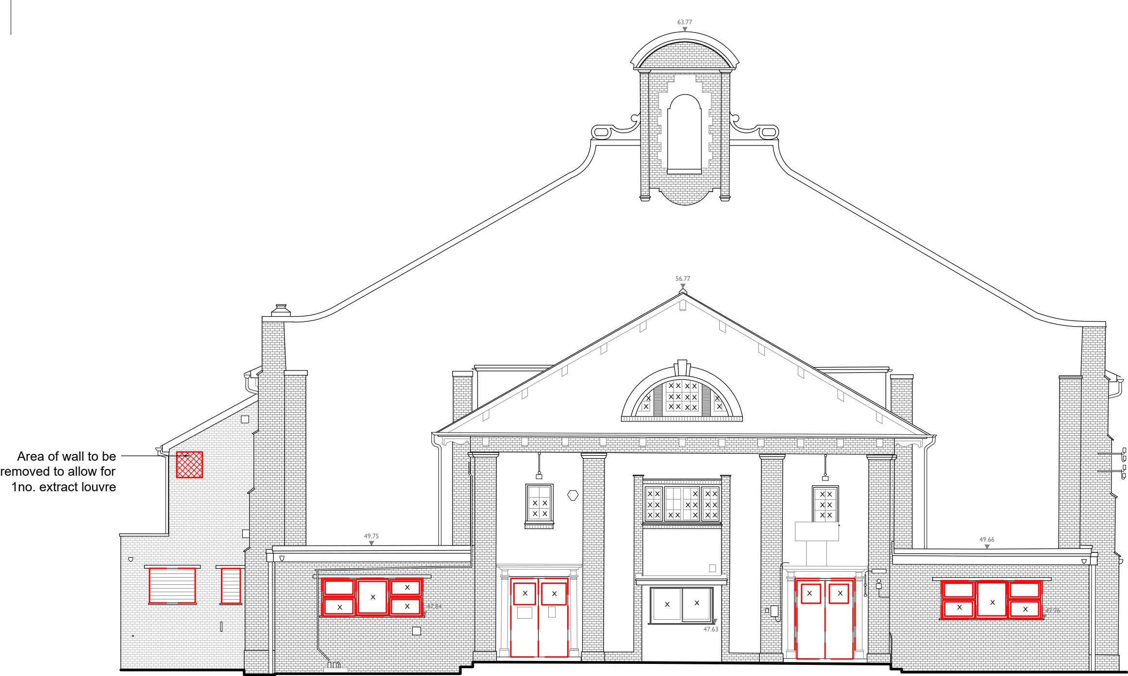
1 South Elevation - Demolition 1060 1:100