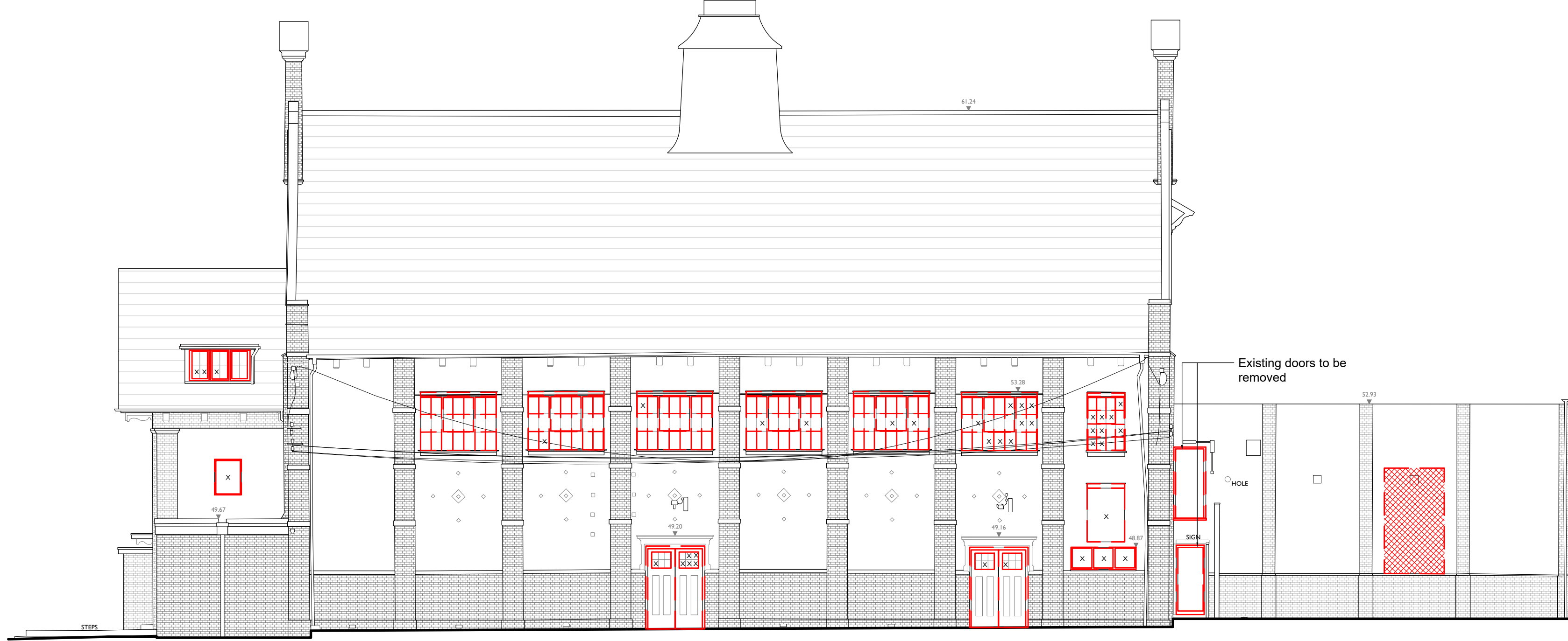
4 East Elevation - Demolition 1060 1:100