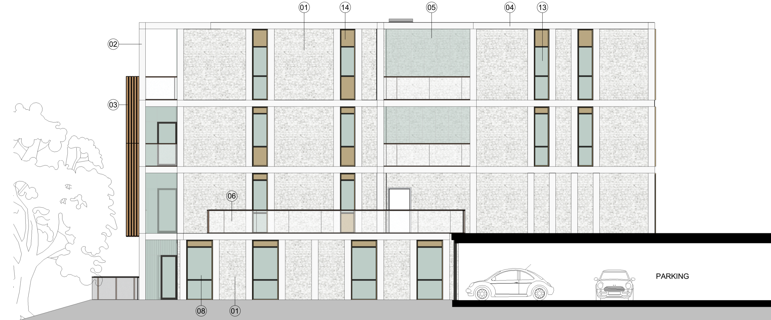
Elevation Block 7 North 1 : 100