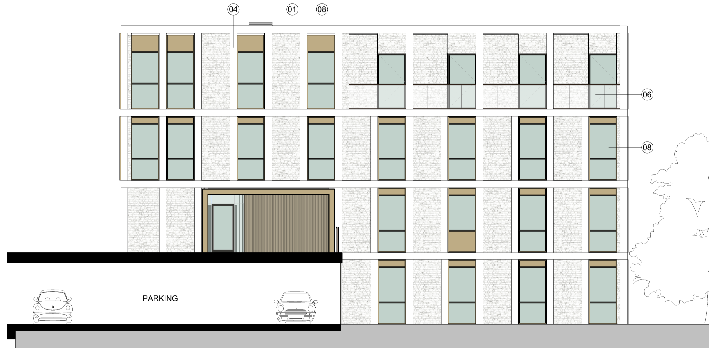
Elevation Block 7 West 1 : 100