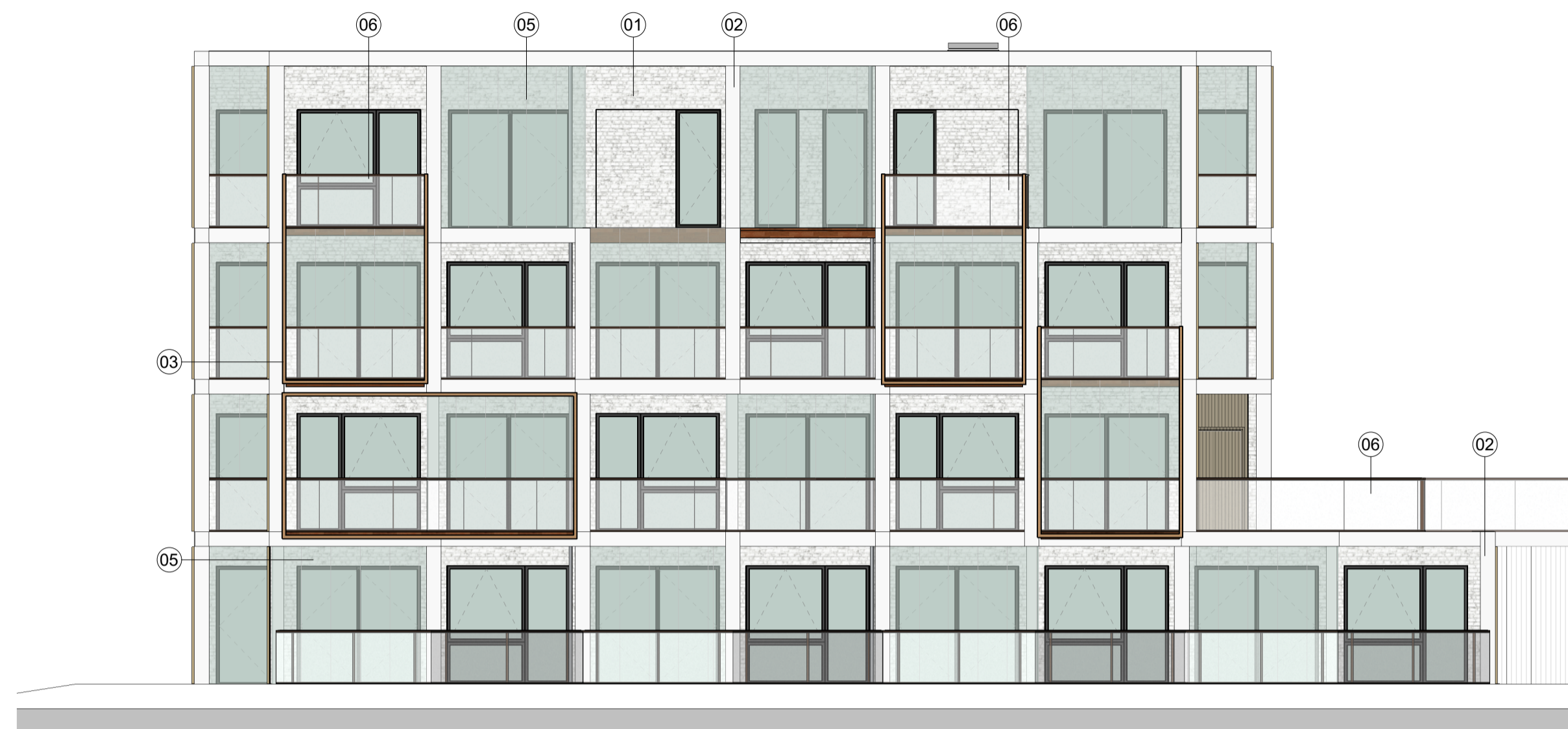
Elevation Block 7 East 1 : 100