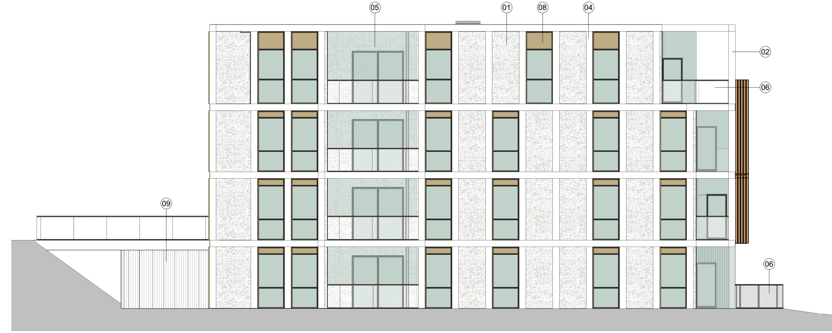
Elevation Block 7 South 1 : 100