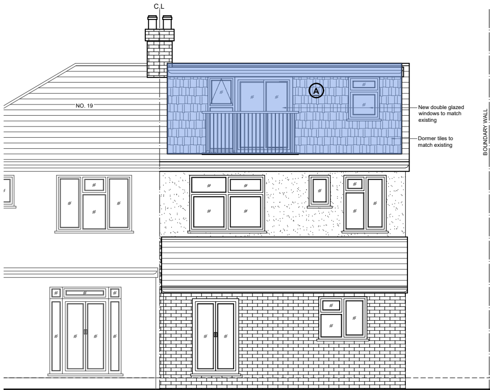
02 - REAR ELEVATION