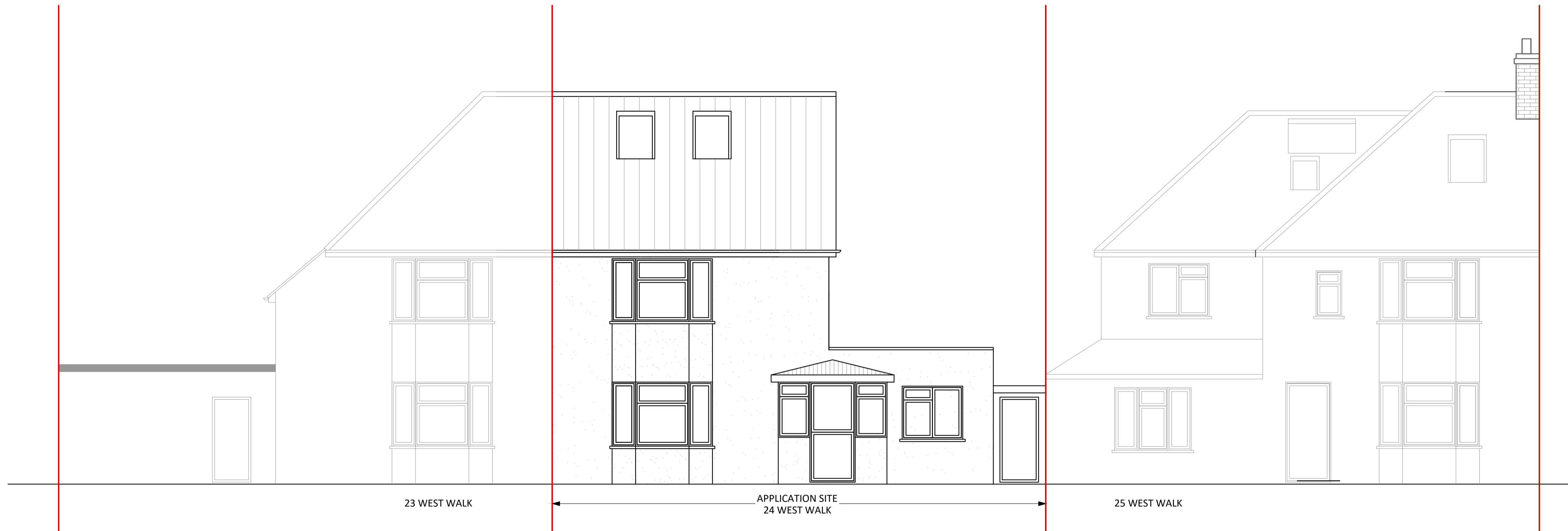
EXISTING STREET ELEVATION