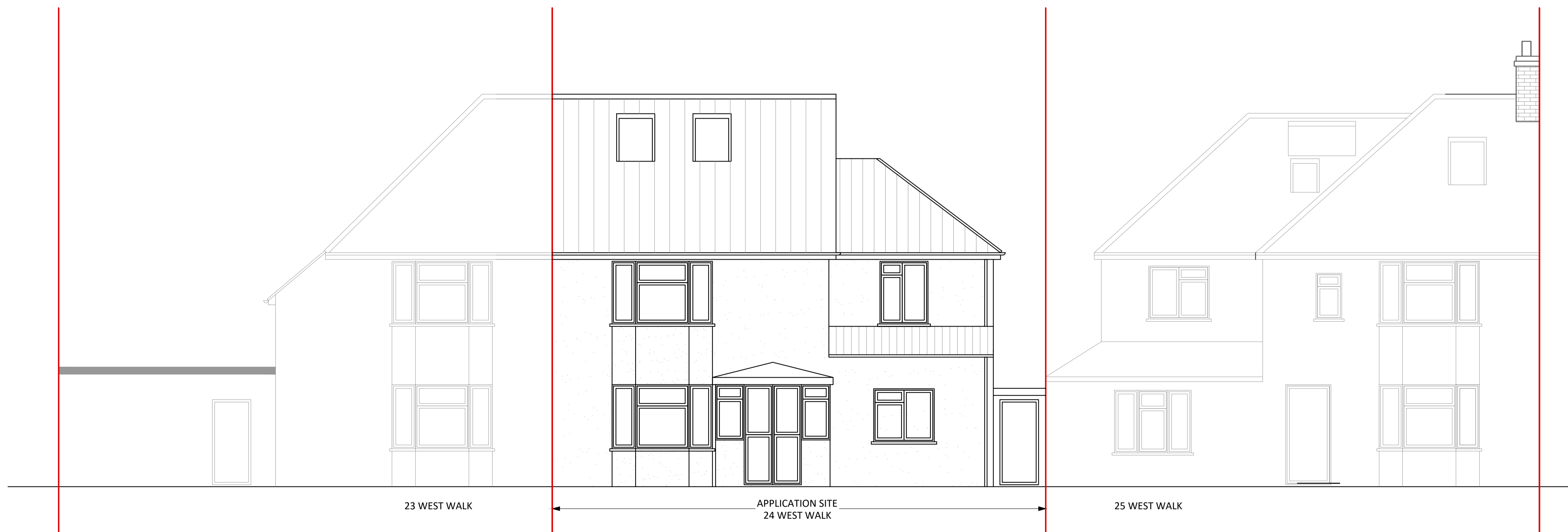
PROPOSED STREET ELEVATION