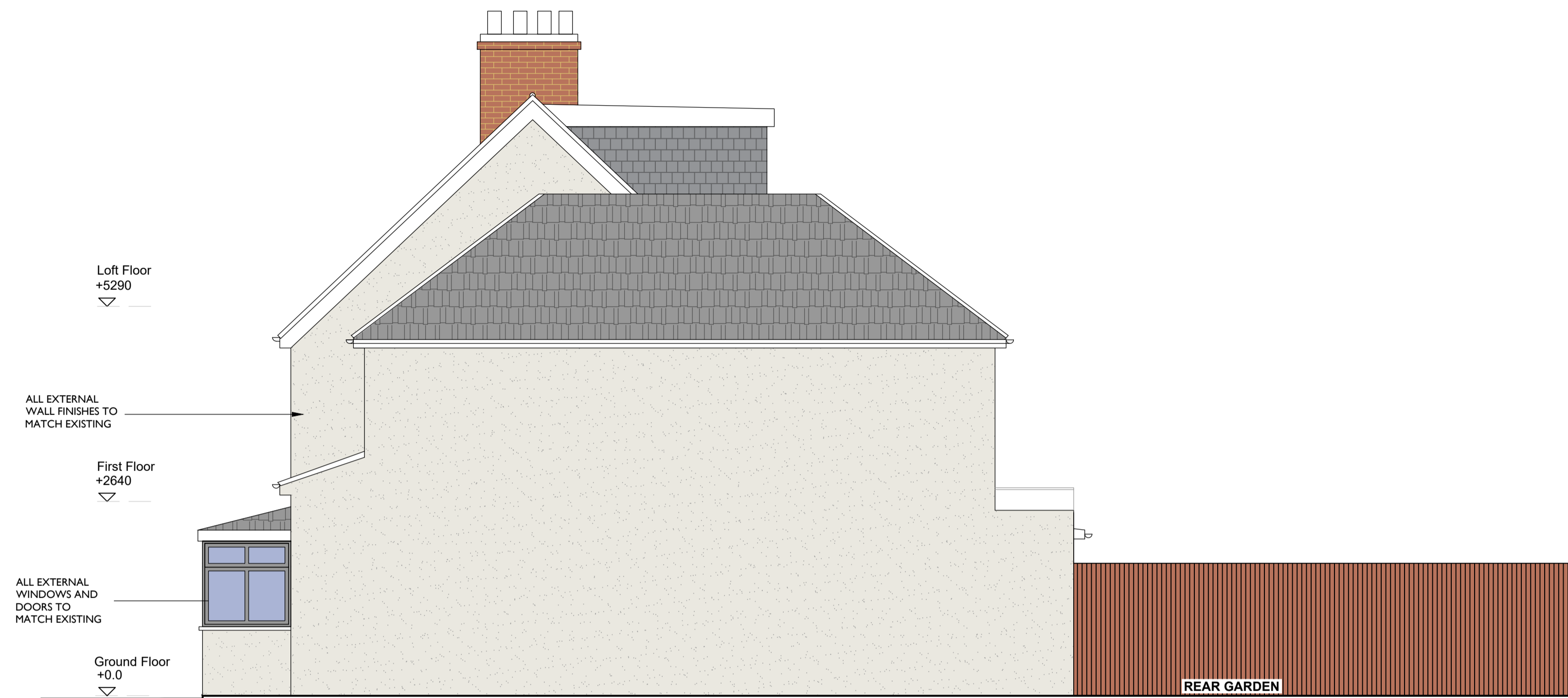
PROPOSED SIDE ELEVATION (ALL LANDSCAPE AND NEIGHBORING PROPERTIES ARE INDICATIVE ONLY)