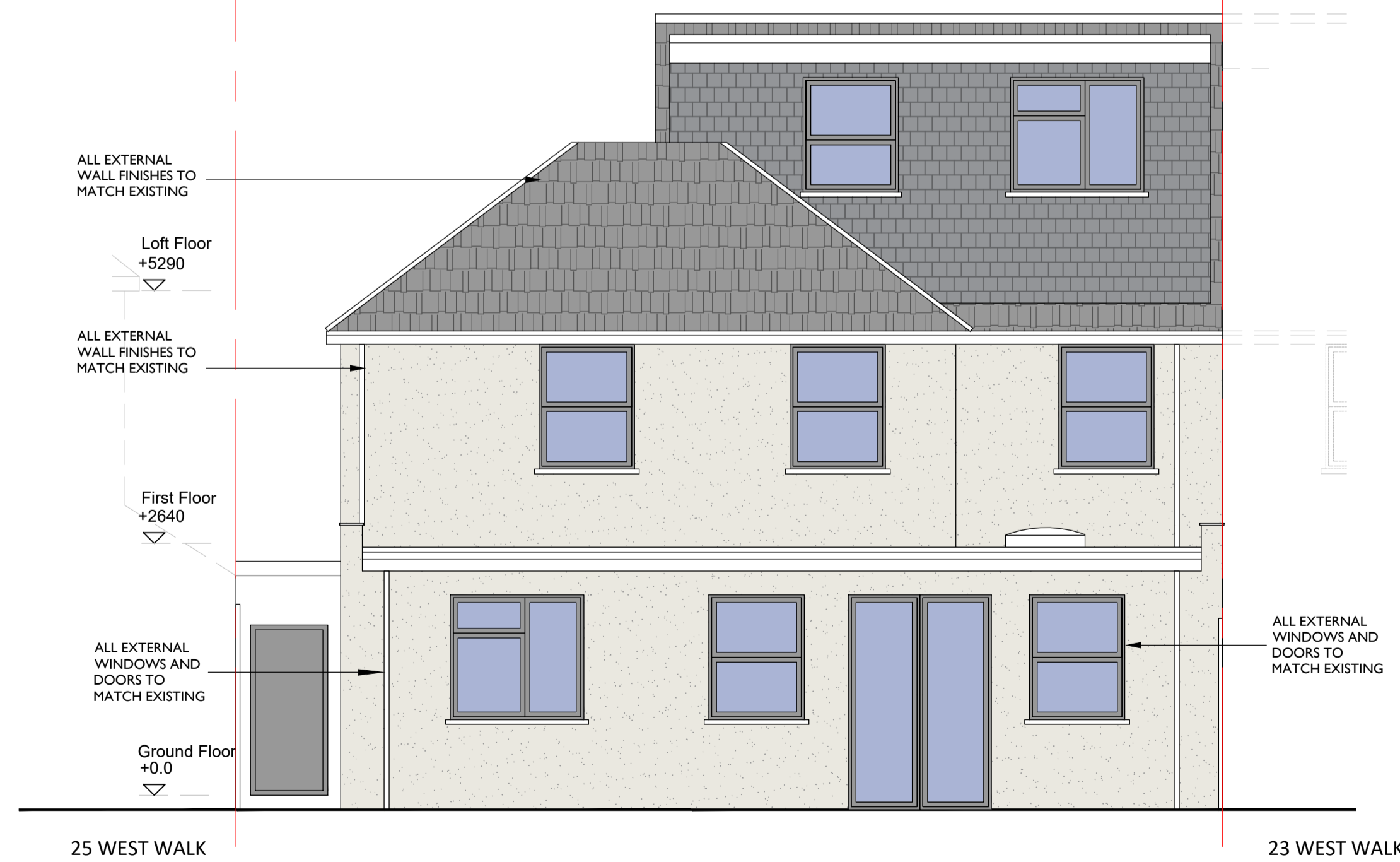
PROPOSED REAR ELEVATION (ALL LANDSCAPE AND NEIGHBORING PROPERTIES ARE INDICATIVE ONLY)