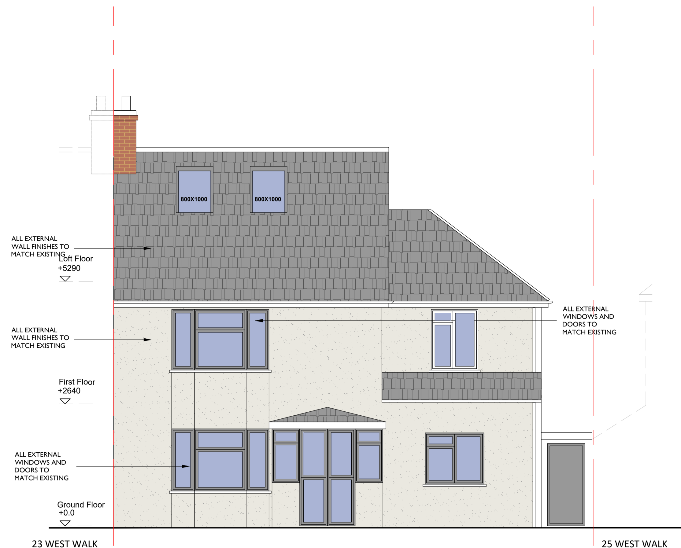
PROPOSED FRONT ELEVATION (ALL LANDSCAPE AND NEIGHBORING PROPERTIES ARE INDICATIVE ONLY)