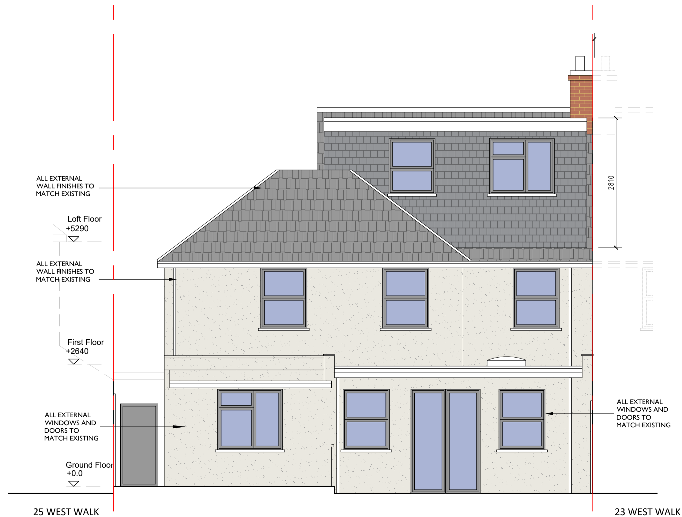
PROPOSED REAR ELEVATION (ALL LANDSCAPE AND NEIGHBORING PROPERTIES ARE INDICATIVE ONLY)