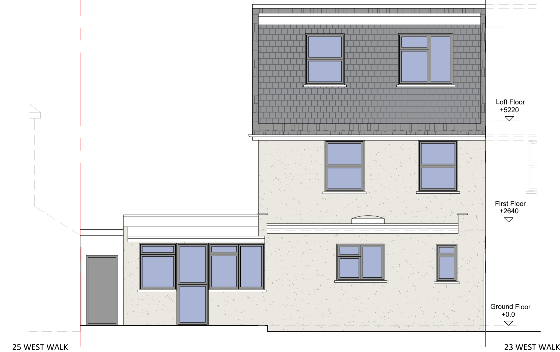
EXISTING REAR ELEVATION (ALL LANDSCAPE AND NEIGHBORING PROPERTIES ARE INDICATIVE ONLY)