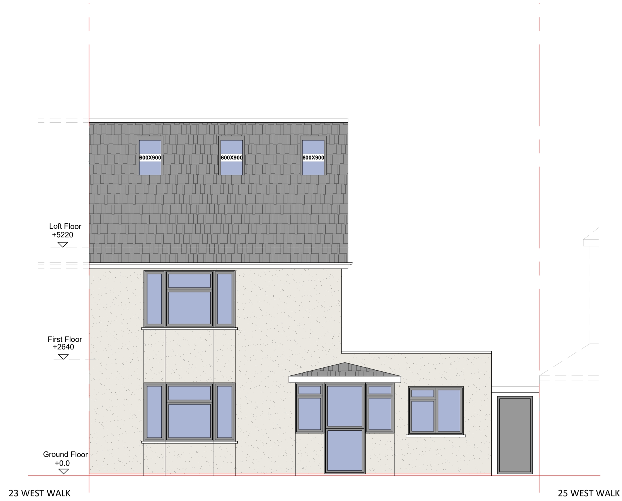
EXISTING FRONT ELEVATION (ALL LANDSCAPE AND NEIGHBORING PROPERTIES ARE INDICATIVE ONLY)