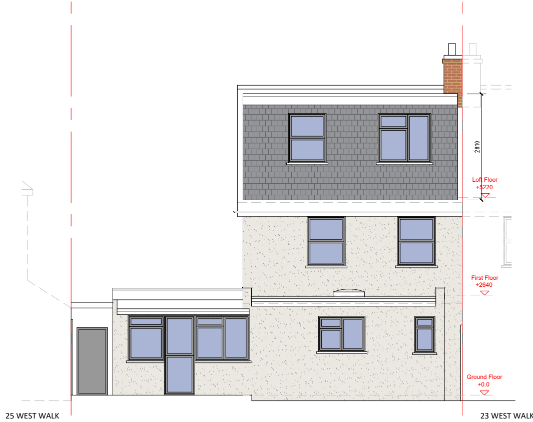
EXISTING REAR ELEVATION (ALL LANDSCAPE AND NEIGHBORING PROPERTIES ARE INDICATIVE ONLY)