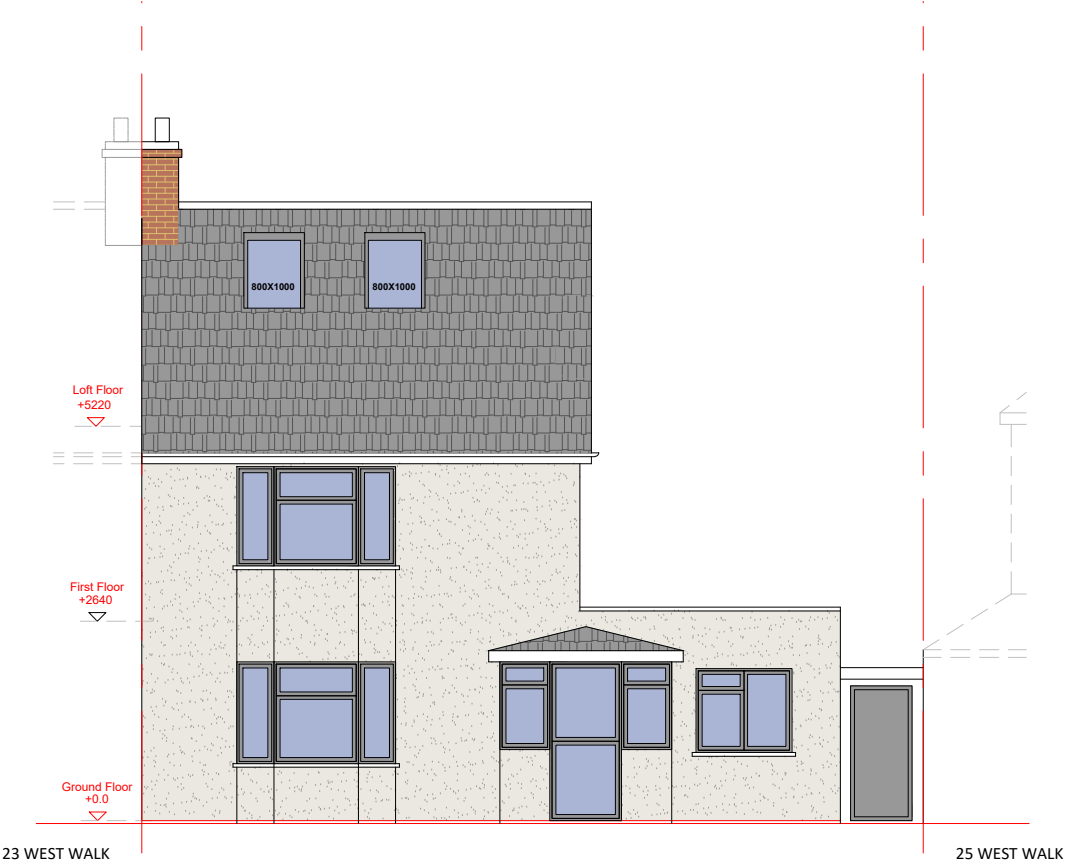
EXISTING FRONT ELEVATION (ALL LANDSCAPE AND NEIGHBORING PROPERTIES ARE INDICATIVE ONLY)