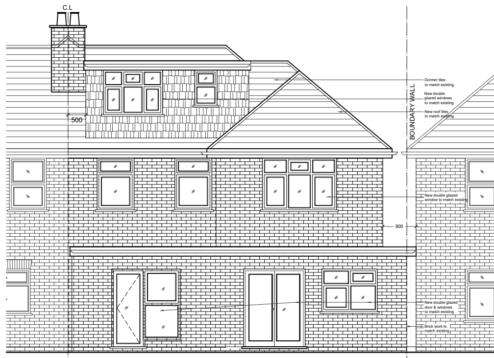
03 - REAR ELEVATION