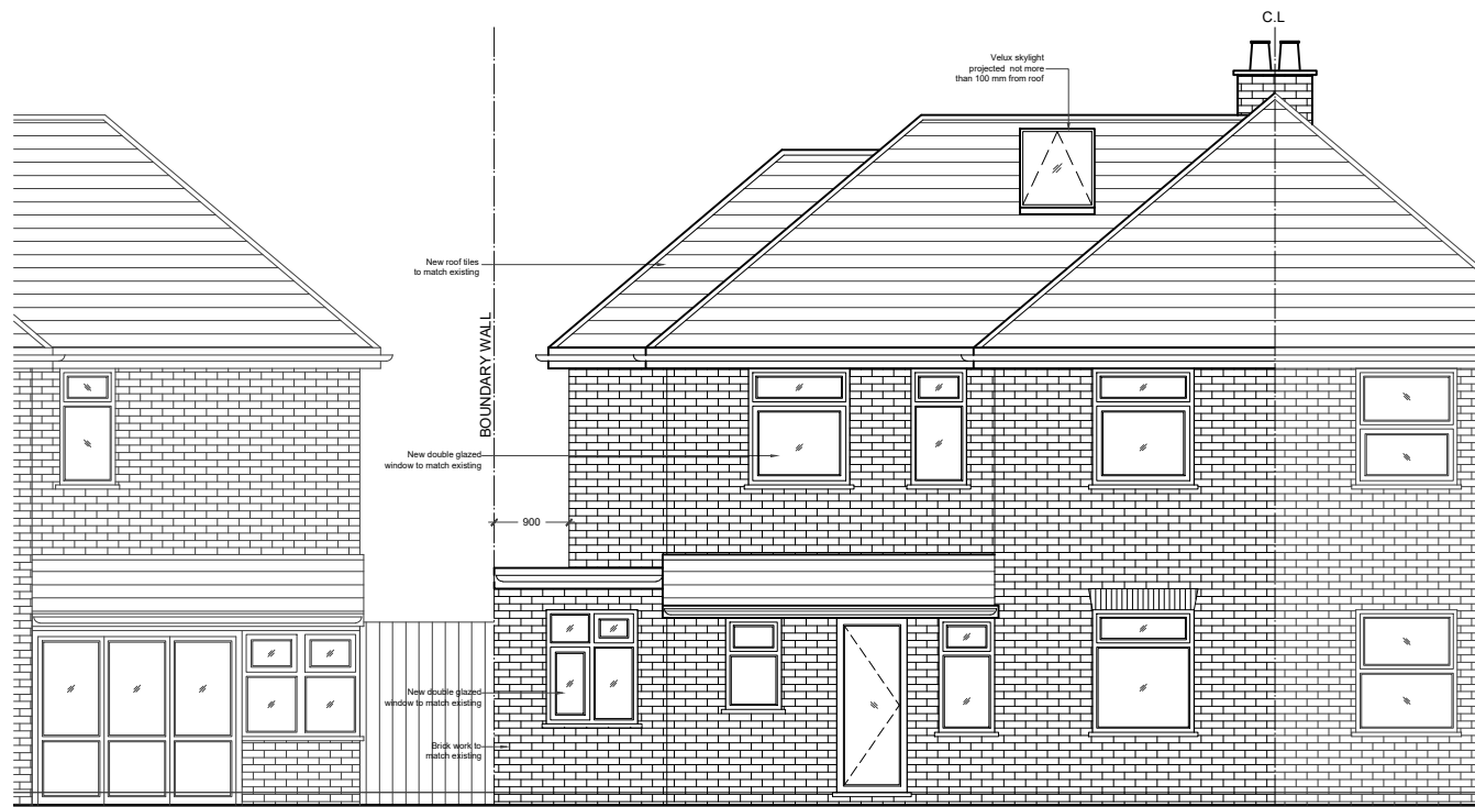
01 - FRONT ELEVATION