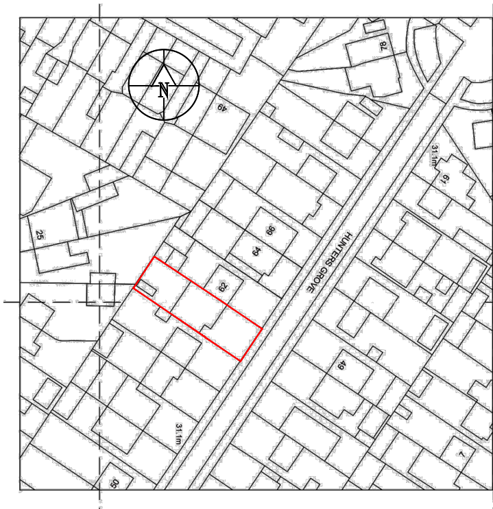
01 - OS MAP SCALE 1:1250