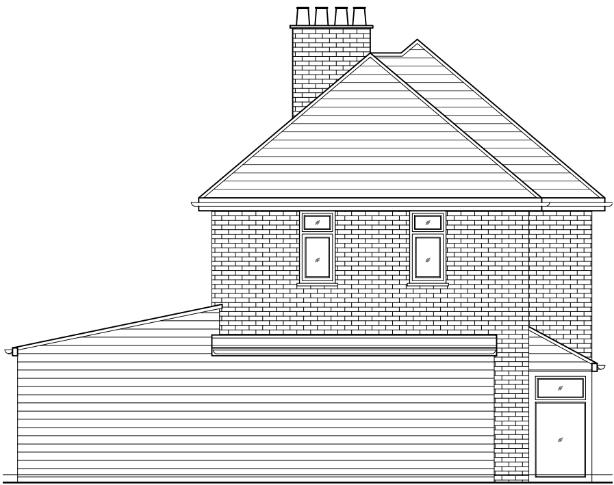
02 - SIDE ELEVATION