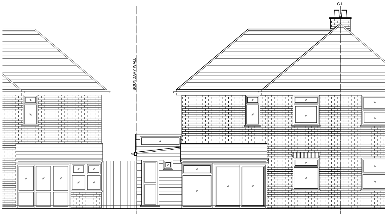
01 - FRONT ELEVATION