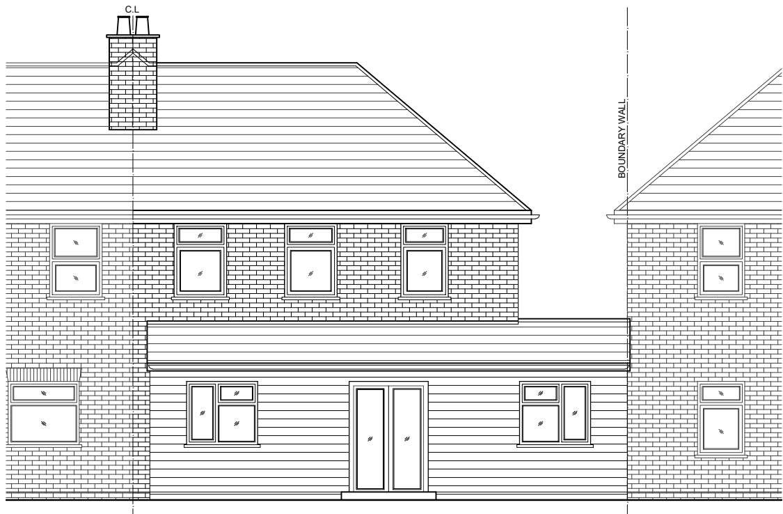
03 - REAR ELEVATION