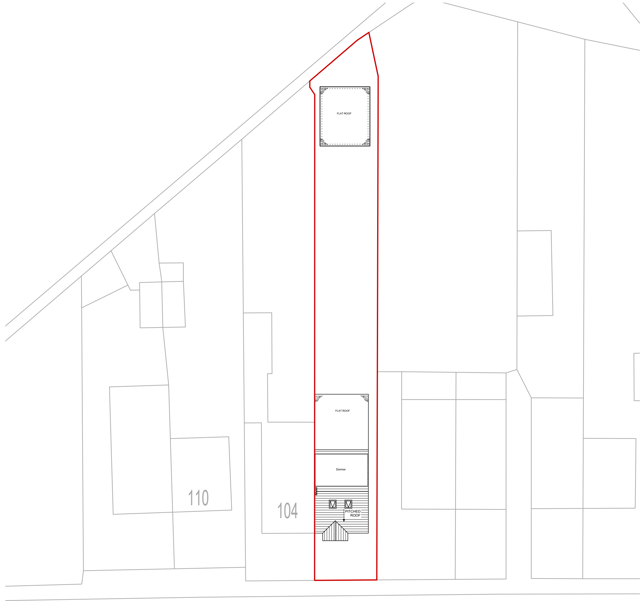
BLOCK PLAN SCALE 1:250