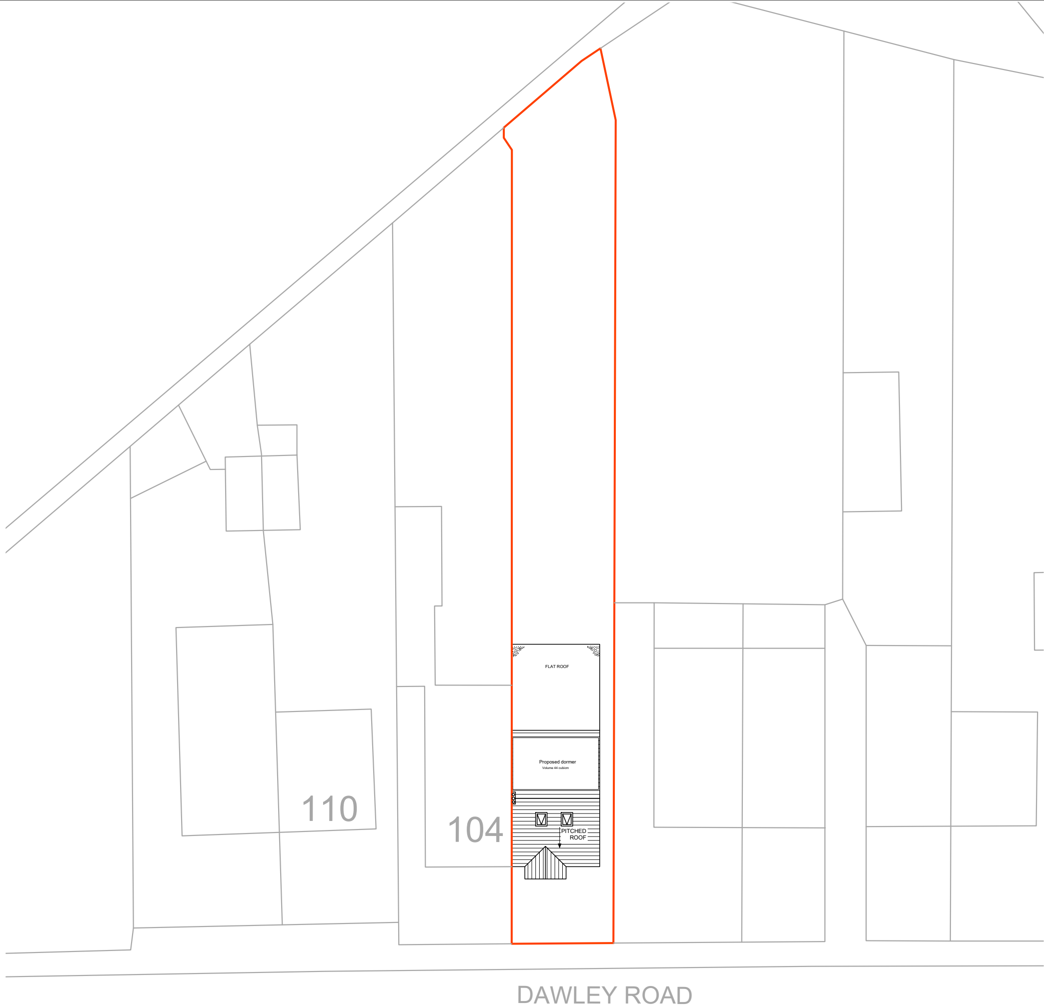
BLOCK PLAN SCALE 1:250