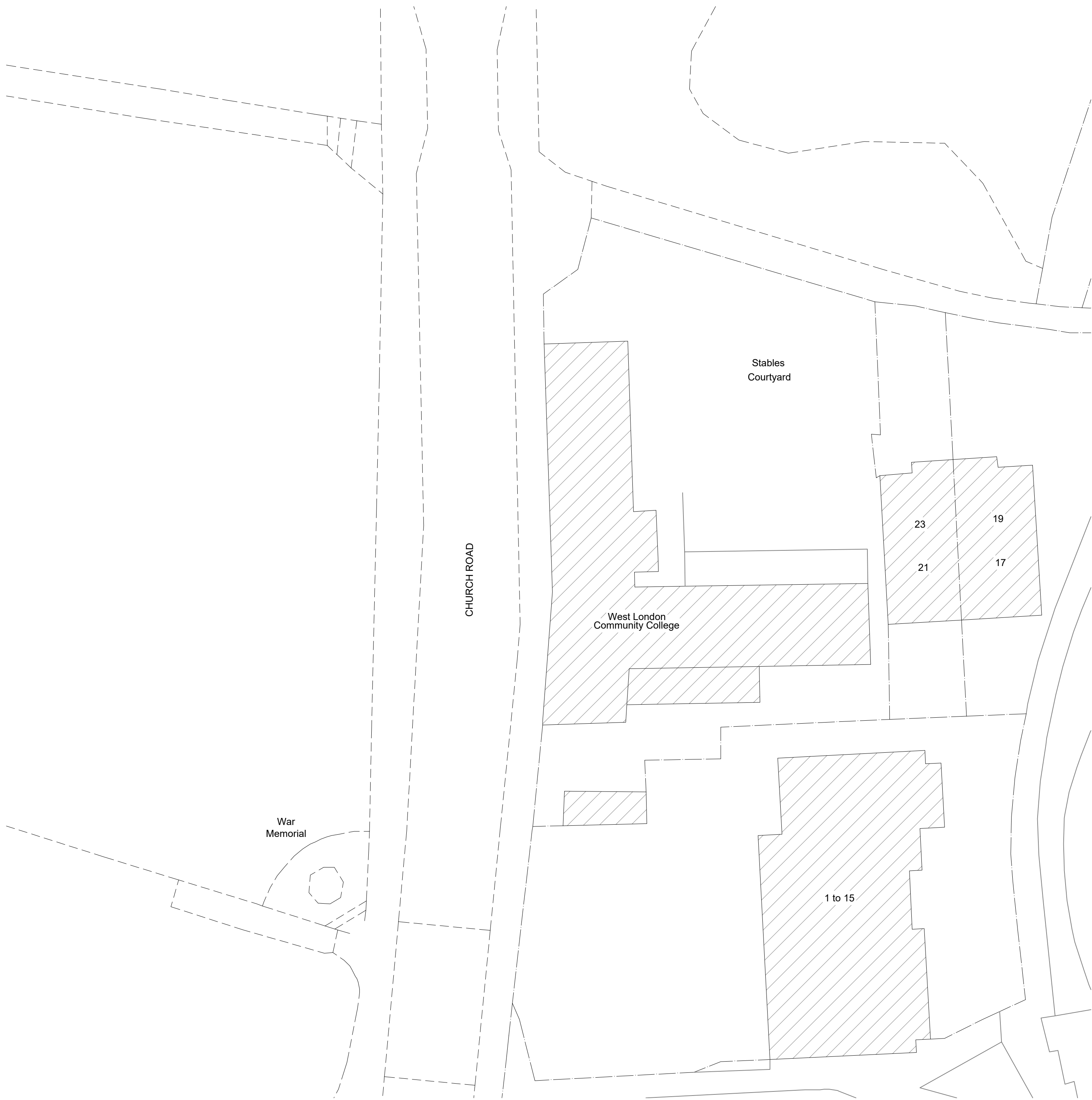
BLOCK PLAN 1:200