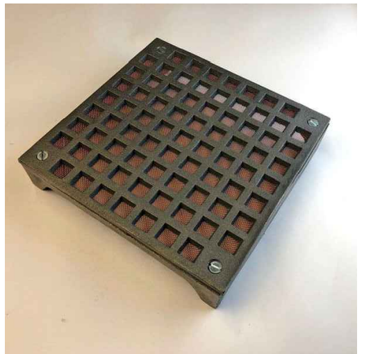
CAST IRON GRILLE VENT