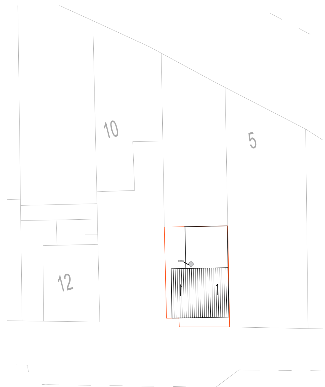
PROPOSED BLOCK PLAN SCALE 1:200