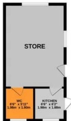
GROUND FLOOR STORE 279 sq.ft. (25.9 sq.m.) approx.