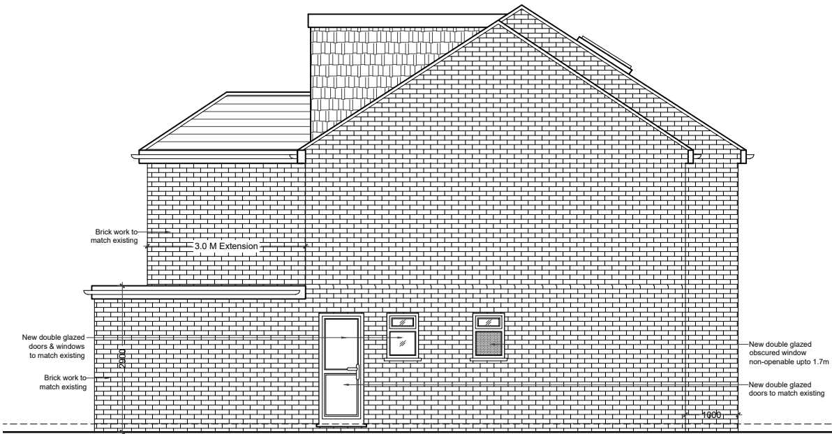
03 - SIDE ELEVATION