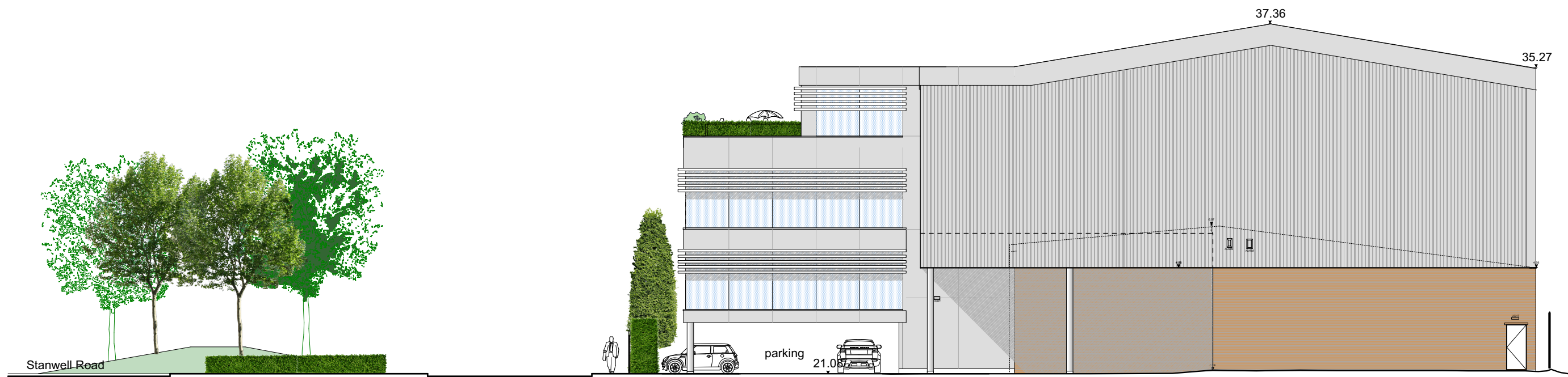
Side (east) Elevation as Proposed