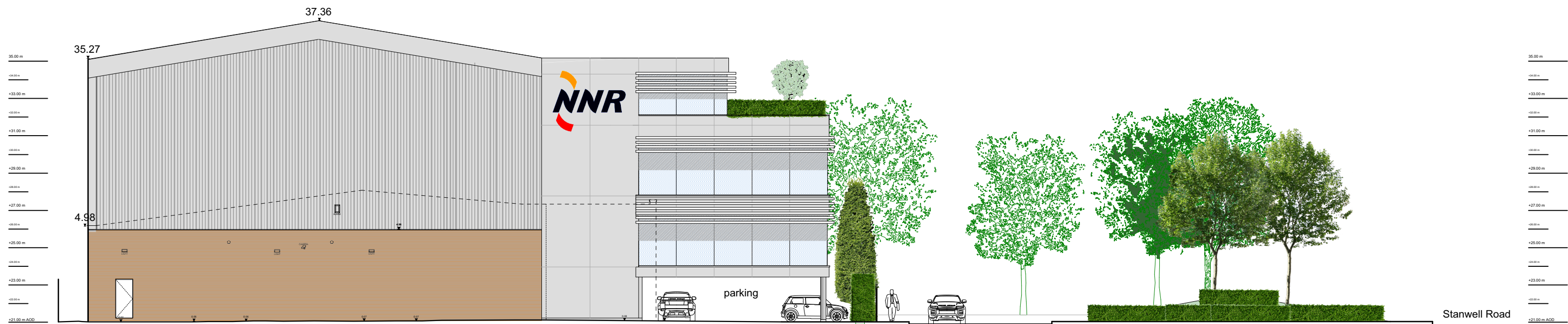
Side (west) Elevation as Proposed

DO NOT SCALE FROM THIS DRAWING. All dimensions must be verified by the main contractor before the commencement on site of any item of work or the preparation of shop drawings for their own work or that of sub-contractor or suppliers. This drawing is to be read in conjunction with all relevant documents. Any queries or discrepancies must be reported immediately to the architect. This document is copyright of DDWH Architects Ltd.