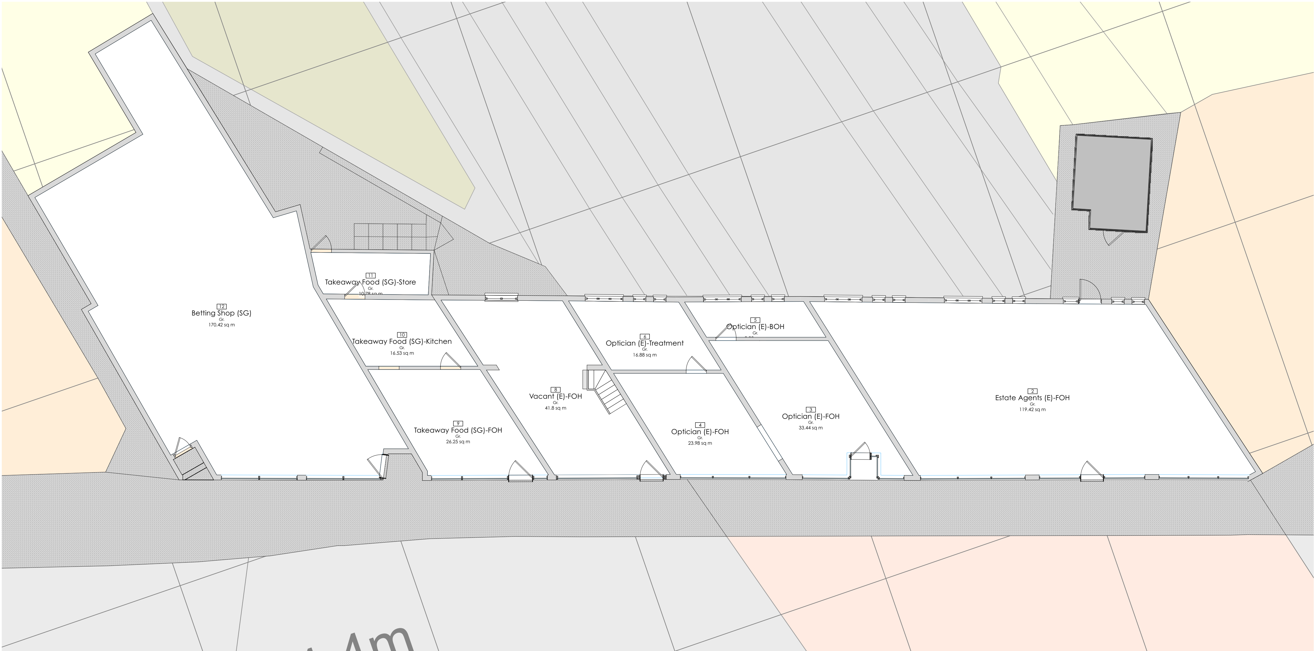
2 Block Plan 2001 Scale: 1:100

HAZARDS LEADING TO UNUSUAL OR SIGNIFICANT RISK DURING THE CONSTRUCTION PROCESS ARE IDENTIFIED ON THIS DRAWING AS: