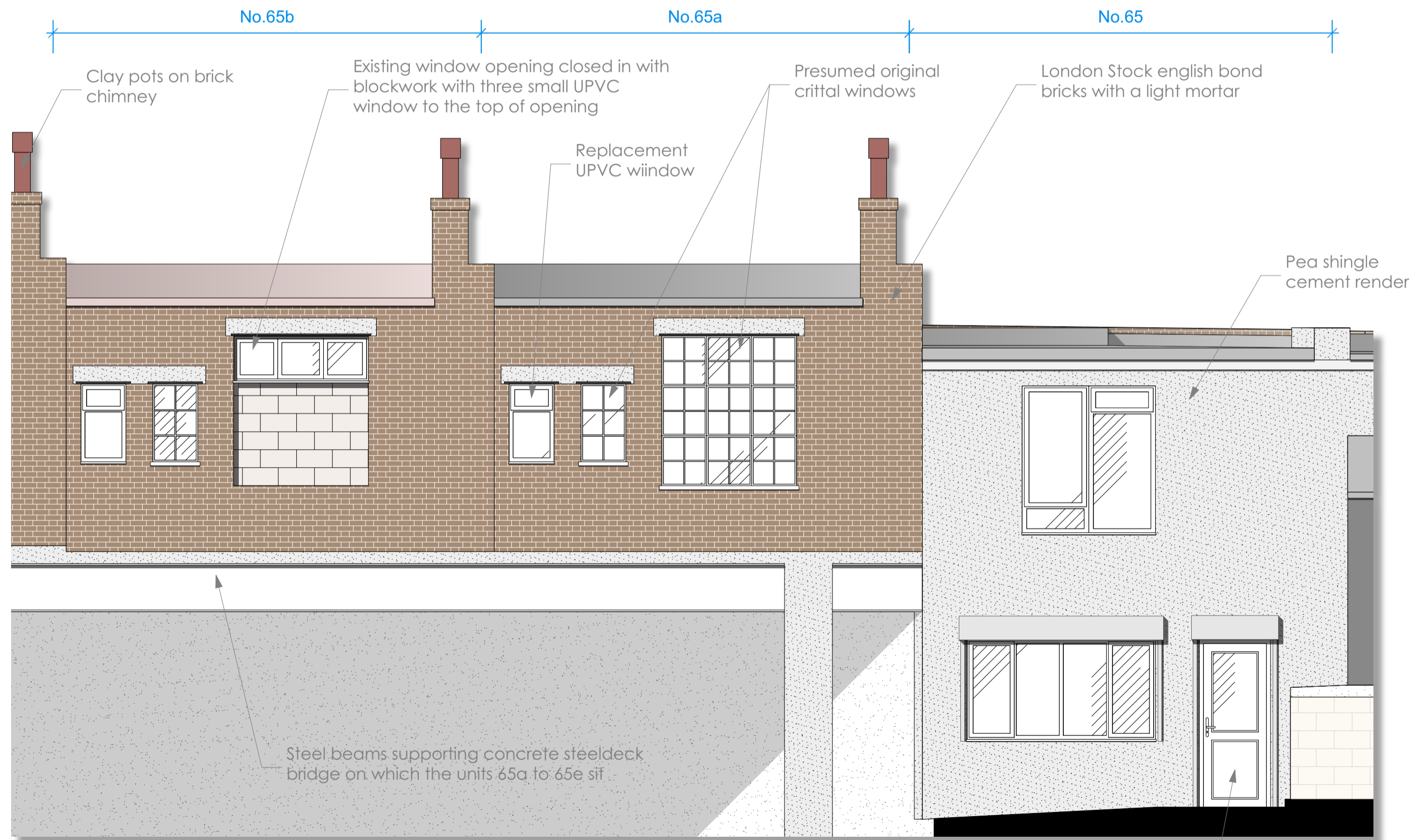
1201 3 Scale: 1:50 North Elevation