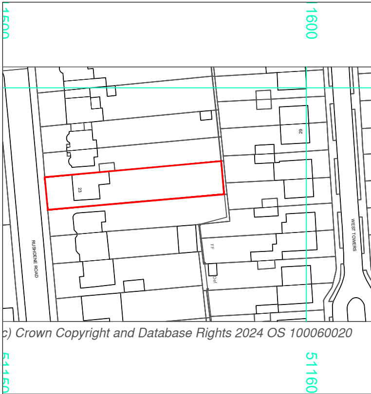
Location Plan 1:1250 0 50m Scale Bar @ 1:1250