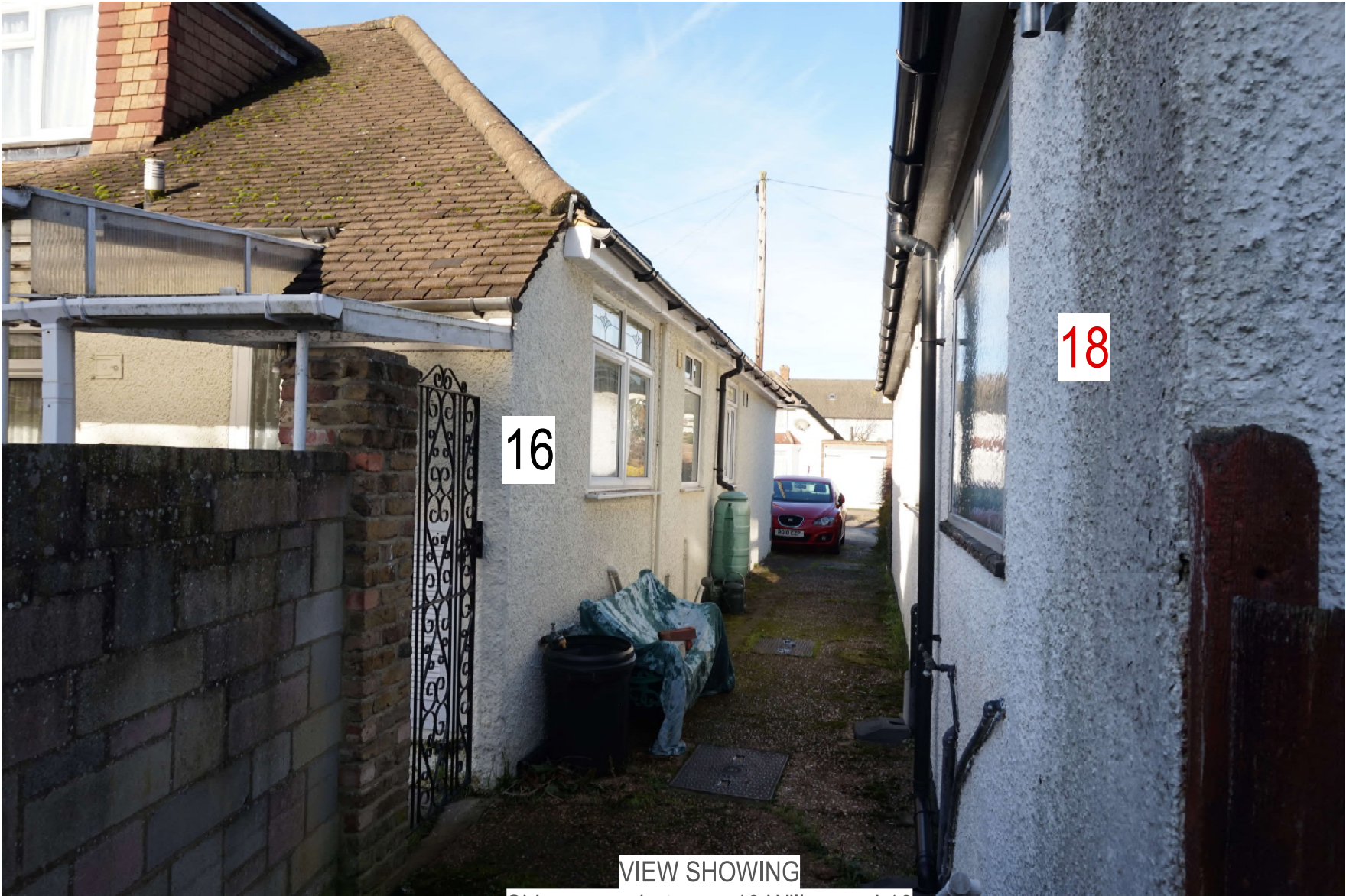
VIEW SHOWING Side access between 18 Willow and 16 Willow, showing a 2M gap between both properties